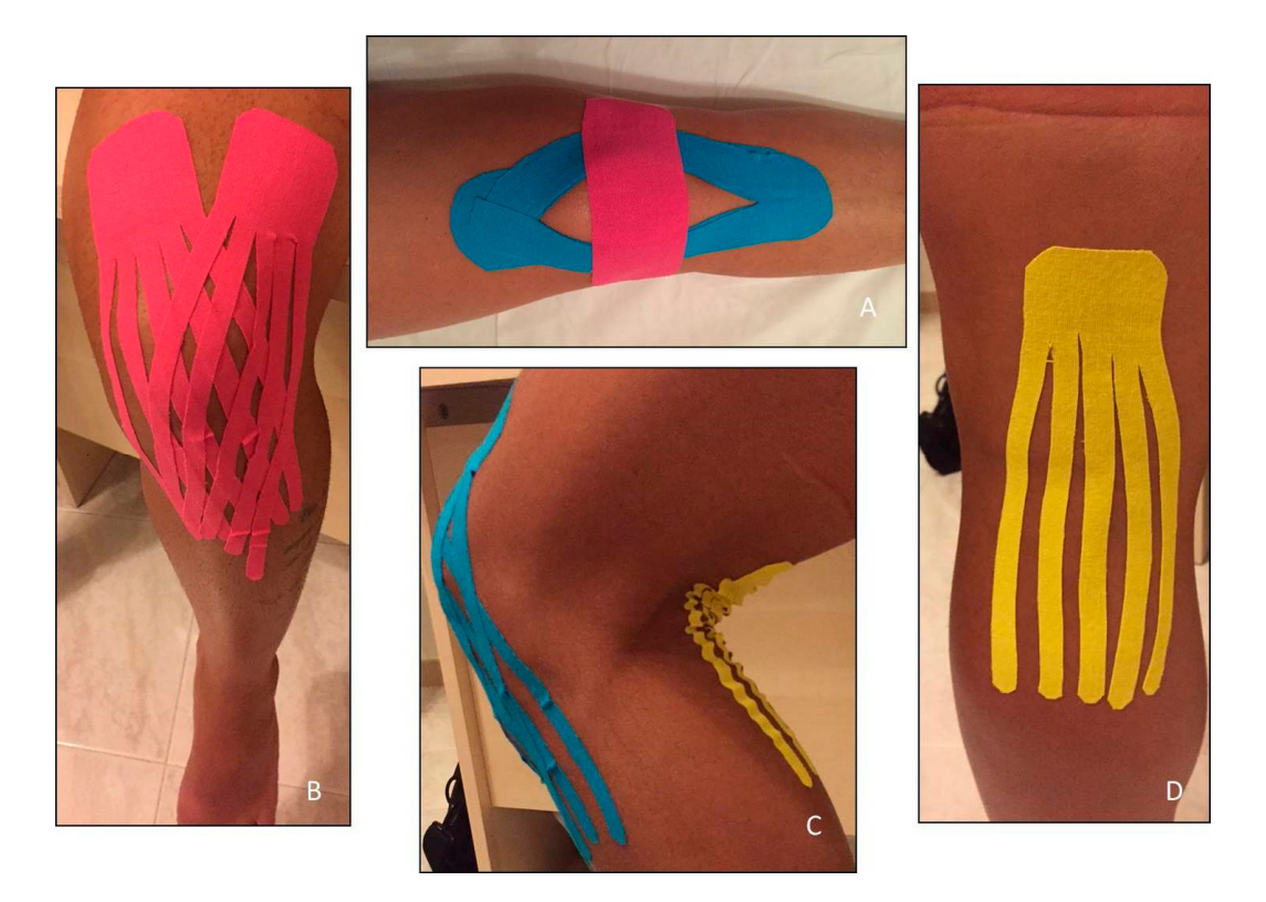
Figure 2. Kinesio tape application. ( A ) With tension (stabilizing effect): 2 'Y-strips' and 1 'I-strip' applied in the anterior region of the knee; ( B – D ) Without tension (draining effect): 2 'fan-shaped strips' applied in the anterior region of the knee; 1 'fan-shaped strip' applied in the posterior region of the knee.

Tapes were replaced at each session (two per week) and were retained during the week. In cases of separation of the tape (which is very rare occurrence), the patient was referred to renew it.