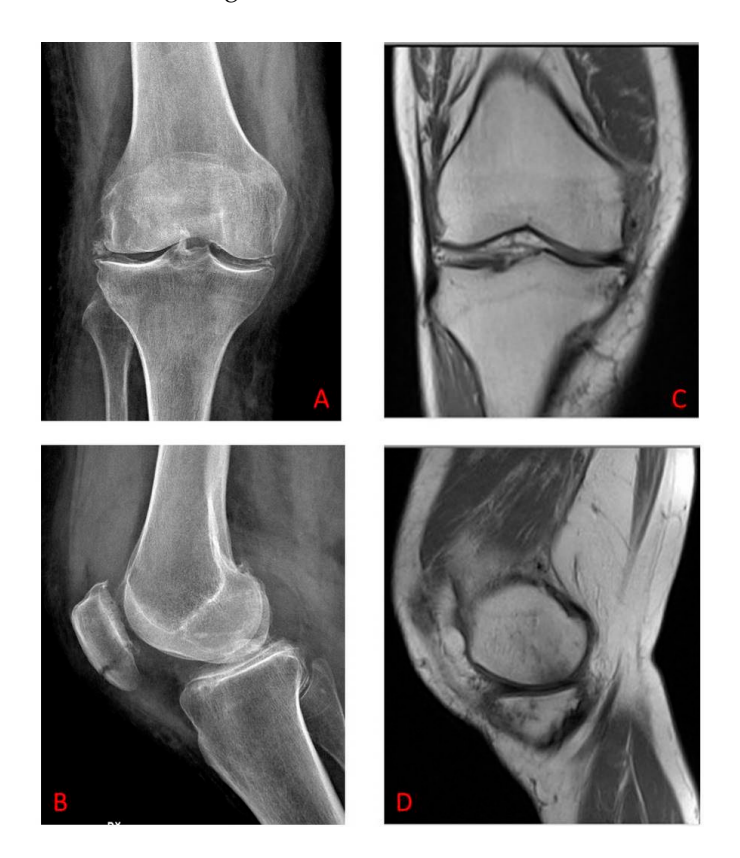
Figure 1. ( A , B ) In the X-ray, there are radiographically-visible changes, such as narrowed joint space and thickening of the articular cartilage, Kellgren and Lawrence grade II/III. ( A ) X-ray anteroposterior projection in osteoarthritic knee from osteoarthritis (OA) patient; ( B ) X-ray lateral projection in osteoarthritic knee from OA patient. ( C , D ) In the MRI (magnetic resonance imaging), the signal intensity of the menisci is altered; the articular cartilage and the subchondral bone are also altered with increased bone density, KL Grade II/III. ( C ) MRI coronal view in osteoarthritic knee from OA patient; ( D ) MRI lateral view in osteoarthritic knee from OA patient.

Informed consent was obtained from each patient. The research was approved by the Local Medical Ethical Committee (University Hospital of Catania, Catania, Italy) without an assigned number and conformed to the ethical guidelines of the Declaration of Helsinki.