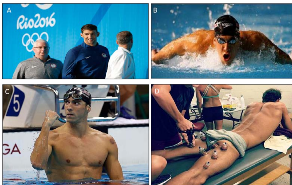
Figure 1. (A,B) Michael Phelps at the 2016 Rio Olympics in Rio de Janeiro, Brazil 2016; Creative-Commons Licensed. Source: http://www.flickr.com/search/advanced/ ; (C) Michael Phelps with a red cupping mark on his shoulder as he competes in the Men’s 4 × 100 m Freestyle Relay Final at the 2016 Rio Olympics in Rio de Janeiro, Brazil 7 August 2016; Creative-Commons Licensed. Source: Instagram/m_phelps00; (D) Michael Phelps under Cupping therapy; Creative-Commons Licensed. Source: Instagram/m_phelps00.

described in early Chinese books. Zhao Xueming, a Chinese doctor practicing more than 200 years ago, completed a book named “Ben Cao Gang Mu Shi Yi”, in which he described in detail the history and origin of different kinds of cupping and cup shapes, functions, and applications [6]. As stated above, cupping also has a long history in Europe and in Arabic countries. In Europe, cupping therapy was customarily used by monastery practitioners and folk healers up to the 19th century for abscesses, and as a means of extracting poisons from bites made by man, apes, dogs, wild animals, or snakes [7]. In Islamic Medicine, there are basically two forms of cupping (called Hijama by the Muslims)—wet and dry—used for the treatment of every type of physical and mental disease [7].