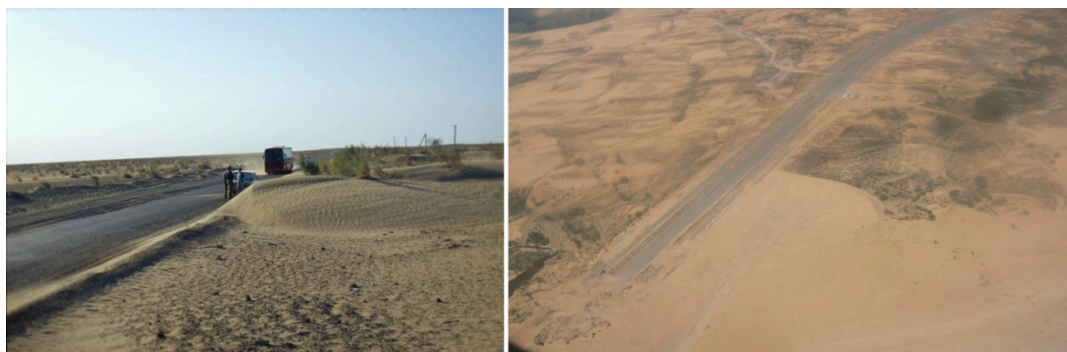
Figure 5. Sanding up of traffic lanes, here: Kyzyl Kum transit road, 120 km north of Bukhara, Uzbekistan.

The corresponding effects of wind-blown deposited (finer) dust are the same as for sand, with exception of the abrasion effects on the vegetation. Instead, the finer dust can congest the vegetation stomata and reduce functionality by covering leaves with a layer of fine sediment. Hirano et al. (1995) have shown for beans and pickles that dust deposition amounts of 1 g/month can already have significant negative effects on plant physiology. Dust on leaves may increase the leaves' temperature because of the increased absorption of infrared radiation. Hirano et al. (1995) expressed that the absorption intensity depends on the color of the dust. However, they also described a shading effect, which increases with decreasing grain size. This shading also negatively affects the photosynthesis efficiency and the primary production of the vegetation. Leaves' stomata can get blocked by fine dust particles as well, which prevents them from fully closing during the day increasing transpiration losses and lowering water use efficiency, amplifying the vegetation's water stress. Contrary to these findings, Sharifi et al. (1997) detected reduced transpiration rates caused by dust-covered leaves. These opposite effects between dust cover and transpiration require more detailed comparative analyses.