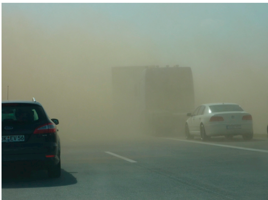
Figure 2. Dust storm on the Highway (Autobahn) 19, south of Rostock, 8 April 2011.

2010 (Kononov et al. 2011), land use activities, e.g., the US Dust Bowl (McLeman et al. 2014), and other reasons. The reduced visibility and the high particle concentration may affect air transport in general. Continuous delivery of high particle concentration in diverse atmospheric layers as it occurs for example in combination with volcanic eruptions furthermore can be especially dangerous for jet planes and interrupt air traffic for several days, as in the case of the Eyjafjallajökul volcano eruption on Iceland in 2010. Reduced visibility through dust storms also occurs in the near-surface boundary layer and affect road traffic, as one of the authors witnessed on a highway south of Rostock, Germany, on 8 April 2011 (Figure 2), where eight people died, 41 were injured, and 150 cars were damaged because of sudden and dramatic reduction of visibility.