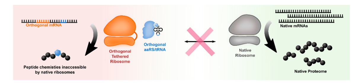
Figure 3. Using orthogonal ribosomes to segregate nsAA incorporation into select proteins. Ideally, when native and orthogonal ribosomes coexist in a cell, they do not interact. The native transcriptome is translated by wildtype ribosomes, whereas orthogonal mRNAs are selectively translated by orthogonal tethered ribosomes (oRiboT). These mRNAs contain reassigned codons that are suppressed by an nsAA-charged tRNA.

As these limitations begin to be addressed, orthogonal ribosomes will likely play a key role in template-directed production of polymers with expanded chemistries, thus pushing the boundaries of the translation apparatus and expanding the genetic code to polymerize new classes of materials (Figure 3).