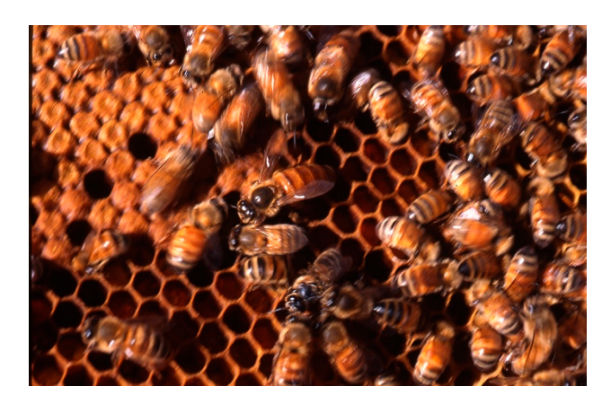
Figure 1. Apis mellifera.

Bee venom therapy (BVT) is the medicinal application of BV from honeybees into the human body for the treatment of some diseases, such as rheumatism arthritis [7]. This strategy has been used in alternative medicine for more than 5000 years. It consists of either indirect application, by extracting BV with an electric stimulus followed by its injection into the body or directly via bee stings [8] (Figure 2). The idea of using BV in the medicinal field was raised from the belief that beekeepers hardly suffer from rheumatism or joints problems.