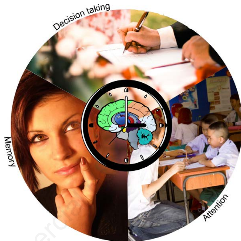
Figure 1. The central nervous system has a critical role in high hierarchy timing process and executive functions such as memory, decision-making and attention. 2

that are considered to represent specialized timing. 23 Independent of the models, human beings estimate and distort time. 24 Thereby, time notion is dependent on intrinsic (emotional state) and extrinsic context (sensitive