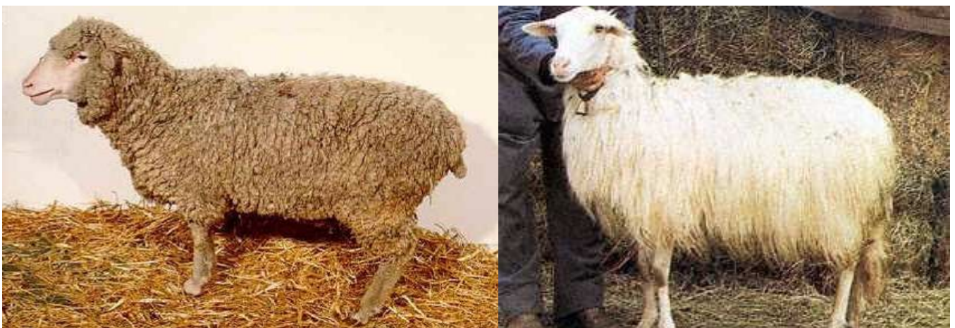
Figure 3. The two breeds analyzed: Gentile di Puglia (left) and Sarda (right).

At stage 02, some interesting genes as those encoding casein K, and proteins involved in oxidoreductase activity (like TGOLN2 and FTH1) and in ECM-interaction (like COL1A2), resulted overexpressed in Sarda. Finally, we can observe in Sarda an overexpression of genes implicated in lipolysis, like lipase (DAGLB) and phospholipase (PLD3). Several studies on different kind of cheeses have demonstrated that the fatty acid (FA) profile of raw milk influences cheese characteristics [22]. Lipolysis is particularly important in sheep cheeses due to the high fat content and lipase activity [35]. In this perspective, we like to stress that in the World the main output of sheep husbandry is cheese making.