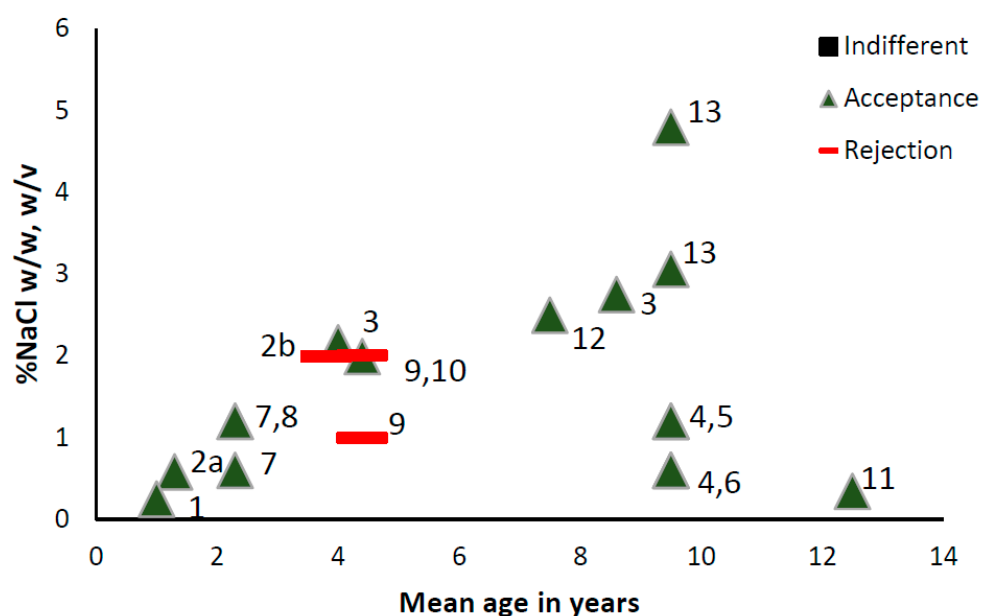
Figure 2. Children's (1–13 years) indifference, acceptance and rejection responses to different concentrations of NaCl in foods (%NaCl w/w ) and liquids (%NaCl w/v ). 1 Harris & Booth 1987, higher consumption compared to unsalted version, mashed potatoes [50]; 2 Beauchamp & Moran 1986, higher (2a) or lower (2b) consumption compared to unsalted version, water [49]; 3 Beauchamp, Cowart & Moran 1990, most preferred, soup [88]; 4 Bouhlal, Chabanet, Issanchou & Nicklaus 2013, more liked than unsalted version, Pasta and green beans [97]; 5 Bouhlal, Chabanet, Issanchou & Nicklaus 2013, higher consumption compared to unsalted version, pasta [97]; 6 Bouhlal, Chabanet, Issanchou & Nicklaus 2013, higher consumption compared to unsalted version, green beans [97]; 7 Bouhlal, Issanchou & Nicklaus 2011, higher consumption compared to unsalted version, green beans [98]; 8 Bouhlal, Issanchou & Nicklaus 2011, higher consumption compared to unsalted version, pasta [98]; 9 Cowart & Beauchamp 1986, lower consumption compared to unsalted version, water [48]; 10 Cowart & Beauchamp 1986, higher consumption compared to unsalted version, soup [48]; 11 Kim & Lee 2009, most preferred, soup [66]; 12 Mennella, Finkbeiner, Lipchock, Hwang & Reed 2014, most preferred, broth [90]; 13 Verma, Mittal, Ghildiyal, Chaudhary & Mahajan 2007, more liked than unsalted version, popcorn (unclear statistics) [89].

Figure 2 provides an overview of the different salt concentrations children like/prefer/accept in different foods.