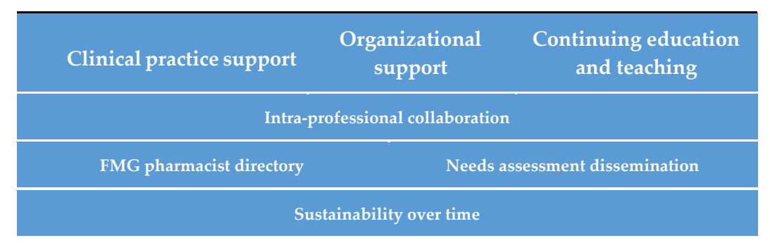
Figure 2. Themes of the Action Plan.

with a long-term horizon). In parallel to writing the action plan, we developed the vision, the mission and the mandate of the practice-based network (Figure 3).