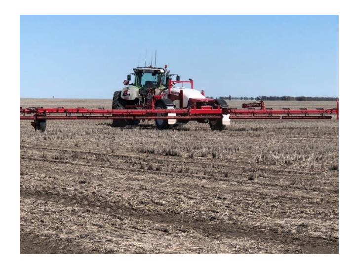
Figure 3. Autonomous site-specific weed control with a real-time weed detection and application sprayer in a fallow field.

Today, real-time weed control in fallow fields ('green on brown', e.g., WEED-It<sup>™</sup> or WeedSeeker<sup>™</sup> sprayers) is becoming more widespread in semi-arid to arid cropping regions (Figure 3). Herbicide savings of up to 90% have been reported [51]. Real-time weed detection/recognition and control in agronomic field crops (i.e., 'green on green') requires seamless integration and high performance of sensors, data processing, and actuation systems. Continuing technological advances in computer vision, robotics, machine learning, etc. are advancing this objective despite the many challenges that range from sensing weed vs. crop plants accurately (e.g., grass weeds in a cereal crop) while moving at speeds of up to 25 km h<sup>-1</sup> to efficiently process and analyze large amounts of generated data [50,52]. Realizing the full potential utility of 'big' data for weed control is still conditional upon establishment of organizational, ethical and legal arrangements of data sharing [53].