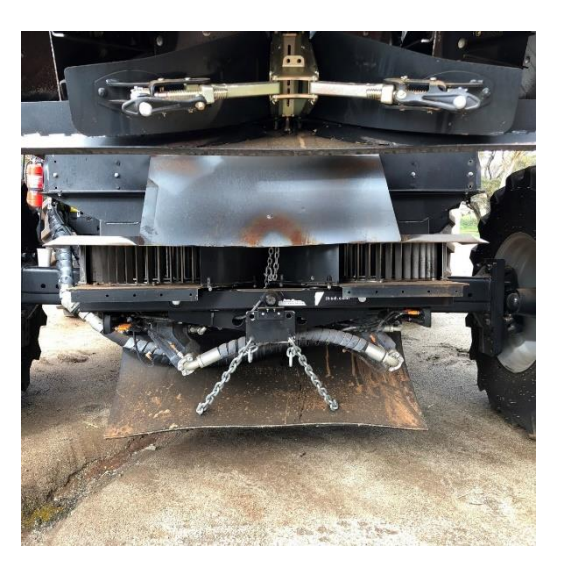
Figure 2. Mechanical seed destruction unit (iHSD) mounted in a commercial combine harvester.

significantly greater than that of the other HWSC practices [42]. Use of chaff carts, or to a lesser extent balers towed behind the combine harvester, is favoured by growers with livestock. However, the low cost of chaff-lining as well as the falling cost and improved engineering of weed seed destruction systems over time will likely increase grower adoption of these systems globally in the future.