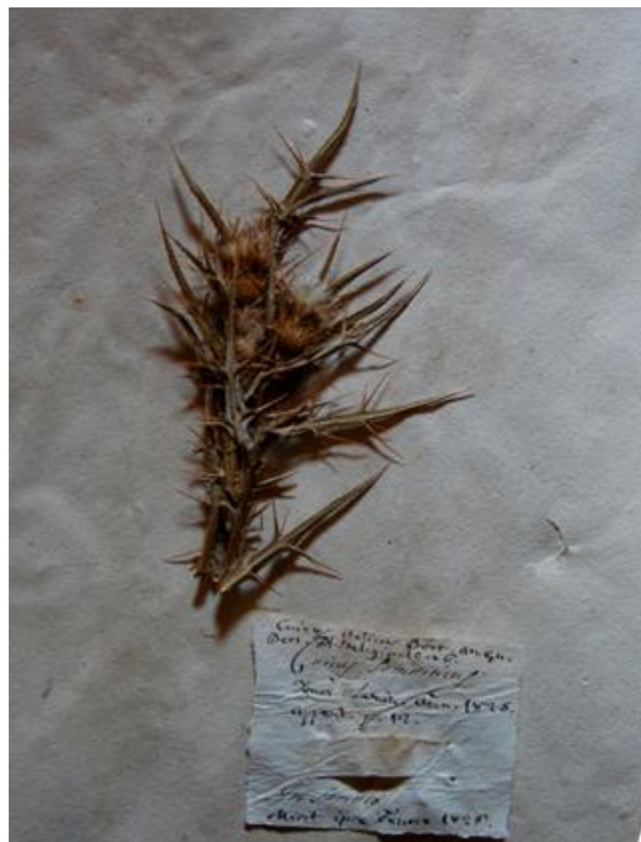
Figure 2. Neotype of Cn. samniticus Ten. (BOLO), by permission of the Curator.

= Cnicus samniticus Ten.—Neotype (designated here): “In Samnio”, s.d. [1825?], s.c., s.n. (BOLO [digital image!]).—Figure 2.