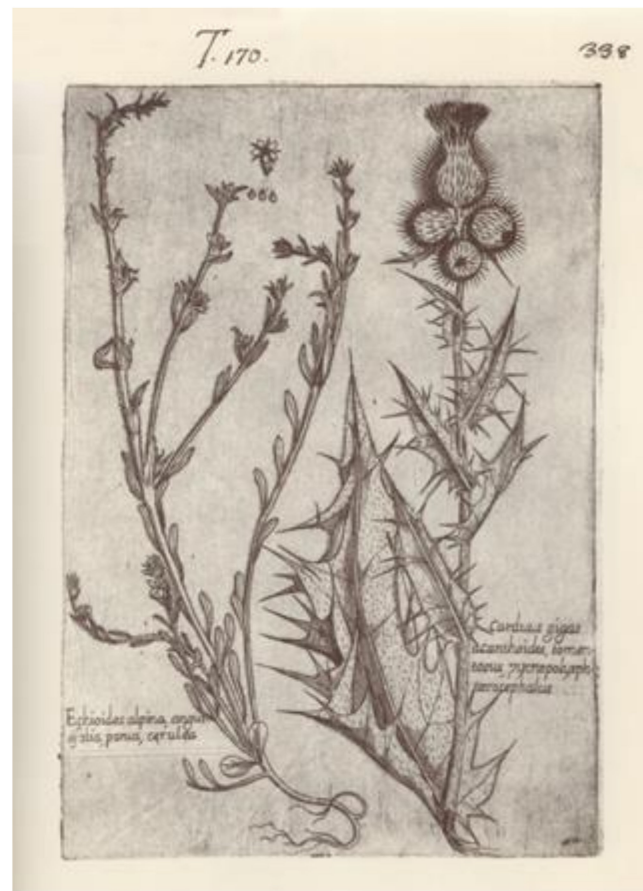
Figure 3. Lectotype of Ca. gigas Ucria (from the Panphyton siculum , plate 170, figure on the right side).

Notes on Ca. scaber —Poiret [56] validly published this name by a Latin diagnosis (“Foliis amplexicaulibus lanceolatis dentato-spinosis supra scabris et viridibus; subtus tomentoso-albis, calyce inermi”; transl.: “[A Carduus ] with leaves embracing, lanceolate, with spiny teeth, bristly and green above, lanate an whitish below, with unarmed involucre”), a description in French, and a taxonomic note. In particular, he hypothesized that the same plant could have been indicated by Tournefort by the polynomial “ Cirsium orientale, cardui lanceolati folio flore purpurascente ”. Finally, he indicated as habitat the stony and dry hills inhabited by the tribe of Nadis, probably corresponding to the area between North Tunisia and Algeria.