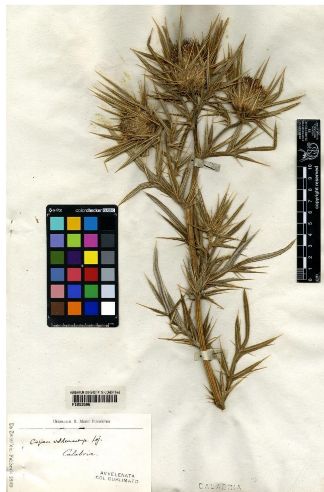
Figure 4. Lectotype of Ci. eriophorum var. vallis-demonii fo. calabrum Fiori (FI., barcode FI053596), by permission of the Curator.