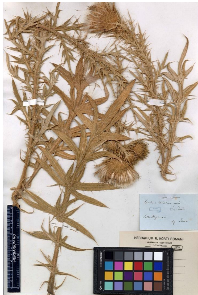
Figure 6. Lectotype of Ci. misilmerense Ces., Pass. & Gibelli (RO), by permission of the Curator.