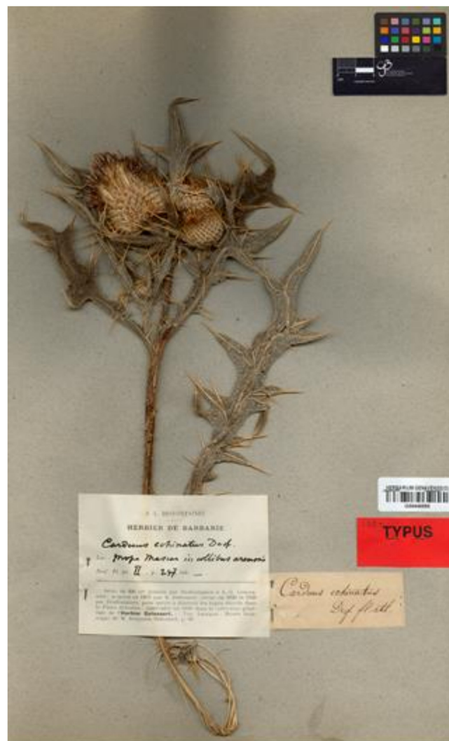
Figure 1. Lectotype of Ca. echinatus Desf. (G), by permission of the Curator.

(2) Cirsium eriophorum (L.) Scop., Fl. Carniol., ed. 2, 2: 130. 1771 \equiv Carduus eriophorus L. (basion.), Sp. Pl. 2: 893. 1753 \equiv Cnicus eriophorus (L.) Roth, Tent. Fl. Germ.: 345. 1788 \equiv Eriolepis lanigera Cass. in Cuvier, Dict. Sci. Nat. 41: 331. 1826, nom. illeg. (Art. 11.4).—Lectotype (designated by Del Guacchio & Iamónico [9] (p. 197)): Herb. Linnaeus, no. 966.32 (LINN [digital image!]).— http://linnean-online.org/9831/ . “ Ci. eriophorum var. vulgare Naeg.”, Syn. Fl. Germ. Helv., ed. 2, 3: 989. 1845, nom. inval. (Art. 26.2). “ Ci. eriophorum subsp. eu-eriophorum var. genuinum Gillot”, Rev. Bot. 12: 360. 1894, nom. inval. (Art. 24.3). “ Ci. eriophorum subsp. vulgare Petr.”, Biblioth. Bot. 78: 15. 1912, nom. inval. (Art. 26.2).