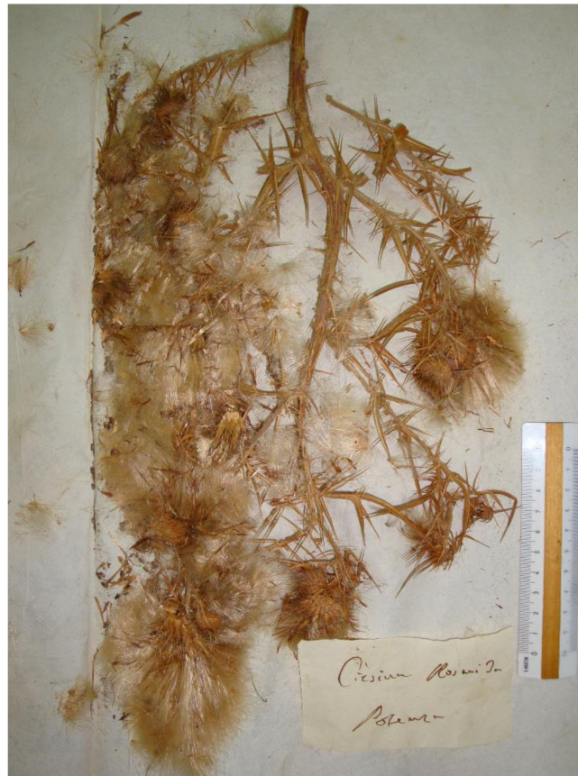
Figure 5. Neotype of Cn. rosani Ten. (NAP), by permission of the Director.

403. 1882 \equiv Ci. lanceolatum subsp. rosani (Ten.) Arcang., Comp. Fl. Ital., ed. 2: 723. 1894.—Neotype (designated by Lacaita [46] (p. 125)): Italy, Basilicata, Potenza, s.d., F. Rosano? s.n. (NAP, collection Tenore!).—Figure 5.