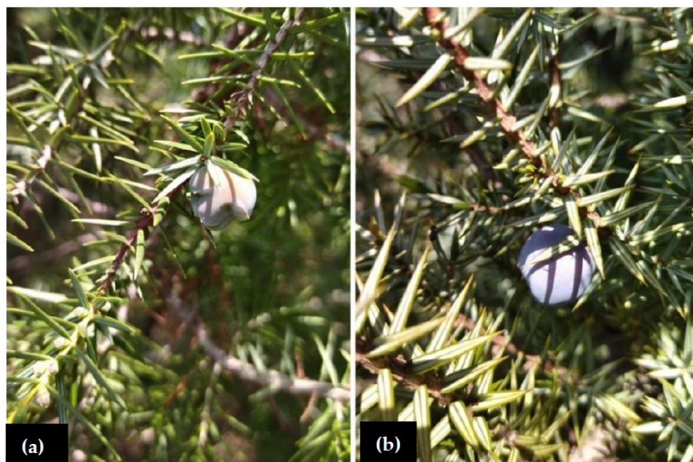
Figure 1. (a) Juniperus oxycedrus L. and (b) J. macrocarpa Sm.

Juniperus oxycedrus L. (prickly juniper, plum juniper, cade juniper, red-berry juniper, cada) is a shrub or small tree native to the western Mediterranean region, from Morocco and Portugal eastward to southern Italy, growing on a variety of rocky sites from sea level up to 1600 m altitude. J. macrocarpa (maritime juniper), which is morphologically [3], molecularly [2], and genetically [4] differentiated from J. oxycedrus , is a Mediterranean species growing on coastal sand dunes. Juniperus false fruits, female cones—improperly called “berries”—are used as a spice, mainly in European cuisine; they are used in Northern European and particularly Scandinavian cuisine to impart a sharp, clear flavour to meat dishes [5]. J. oxycedrus s.l. berries have widely been used in traditional medicine for the treatment of gastrointestinal disorders, diabetes, common colds, as expectorant in cough, to treat calcinosis in joints, as diuretic to pass kidney stones, against urinary inflammations, haemorrhoids, and as hypoglycaemic; leaves and berries are applied externally for parasitic disease [5–9].