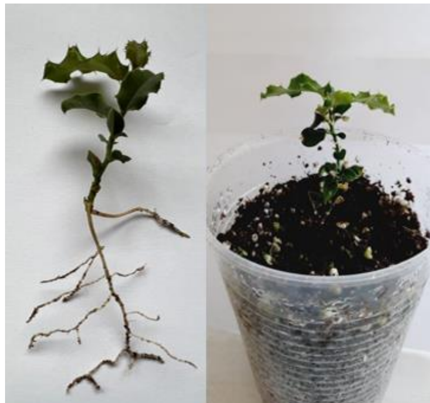
Figure 4. Rooted and acclimated C. mucronata plant.