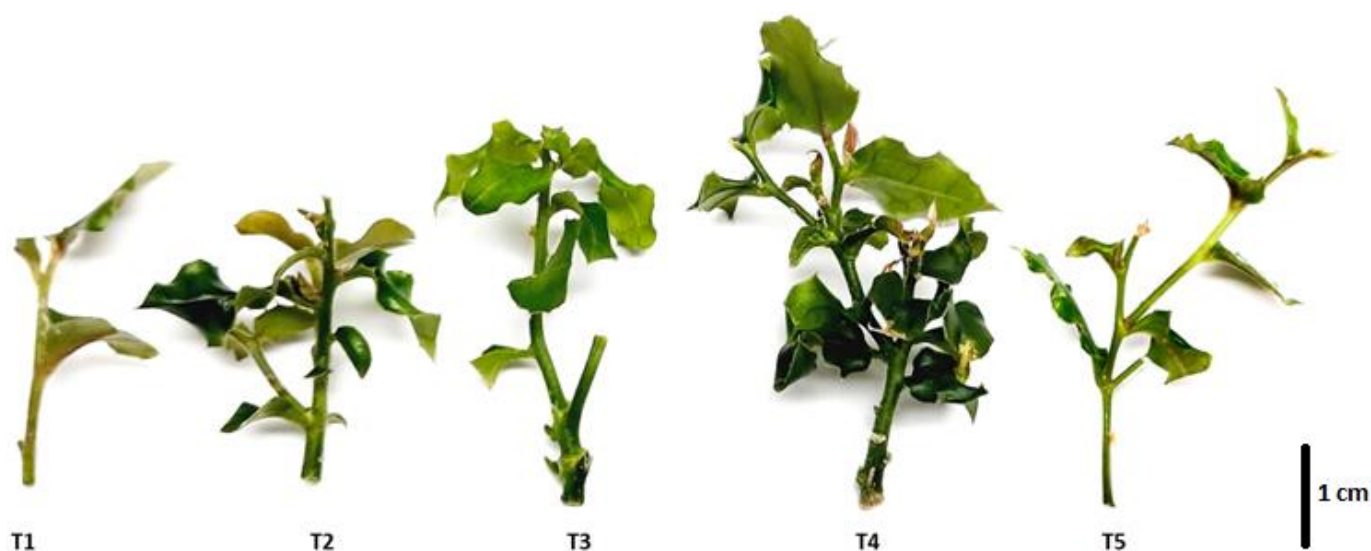
Figure 1. Representative shoots of C. mucronata at the in vitro multiplication stage under different experimental treatments. T1: Control; T2: 1.78 \mu\text{M} BAP; T3: 3.55 \mu\text{M} BAP; T4: 4.44 \mu\text{M} BAP; T5: 11.10 \mu\text{M} BAP. Scale bar 1 cm.

* Letters indicate significant differences according to Tukey's test ( p \leq 0.05 ). Mean \pm standard deviation.