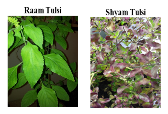
Figure 2. Raam and Shyam (Krishna) Tulsi grown in the UK.

In total, twelve interviews were conducted with South Asian participants from across three cities in the UK (Birmingham, Leicester and London). Two varieties of Tulsi were identified and kept by participants, including Raam and Shyam (Krishna) Tulsi (Figure 2).