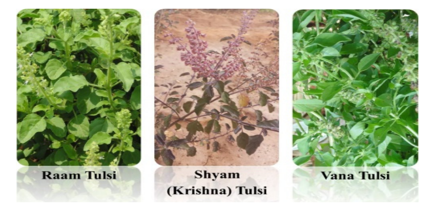
Figure 1. Raam, Shyam and Vana Tulsi grown in Bangalore, India.

The genus Ocimum belongs to the family Lamiaceae. The genus has approximately thirty species including culinary basil ( O. basilicum L.), and the Indian variety, Tulsi ( O. tenui-florum ) [16]. There are a variety of different types of Tulsi available. According to Ayurvedic scriptures the most common are Raam and Shyam (also referred to as Krishna Tulsi). These two types are both classified as O. tenuiflorum whilst the less common Vana Tulsi is commonly assumed to be O. gratissimum (Figure 1), commonly known as African basil [17]. However, recent DNA and chemical analysis of the Vana Tulsi used in commercial teas (Pukka Herbs) shows it to belong to the haplotype characteristic of several basilicum-like Ocimum species [18]. Although the plants are characteristically different, they may all be referred to and kept as Tulsi [2]. Given the success of DNA barcoding for discrimination of Ocimum species, it could be used as an authentication tool to identify adulterants or species substitution [19].