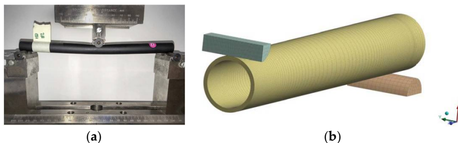
Figure 1. (a) Photo from the three point bending testing of pole samples. (b) FE model of the 3-point bending test utilising symmetry.

In the interest of evaluating the amount of damage initialised by a side impact, a 3-point bending (3PB) test was performed for all poles, see Figure 1a. This was done based on the assumption that the impact load of ski poles can, under realistic circumstances, be well approximated as a quasi-static event, see [1] for a detailed motivation. In the 3PB test, specimens of length 230 mm were supported by two steel cylinders. The load was applied by a third steel cylinder, displaced at a rate of 1 mm/min at the middle of the span until failure. This test allowed to compare the different pole strengths and to see how their material architecture is affecting their performance and damage tolerance.