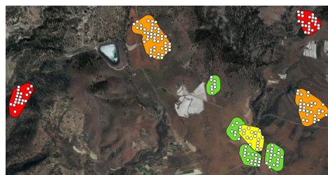
Figure 1. Sample output ADAs and the points defining these. Color coding denotes the quality of the assessment.

Figure 1 depicts the results of such classification process. The colors green, yellow orange and red correspond respectively to levels 1 to 4 of the quality index described above.