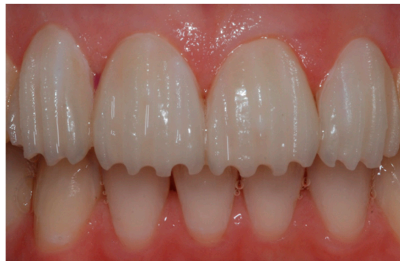
Figure 6. Preparation of the teeth added by the mock-up with proper modifications of the regular technique.

After trying the mock-up from the esthetically and mechanically point of view, a minimal iuxta-gingival butt joint preparation was done. A reduction of 0.5 mm of the buccal plate and of 1.5 mm of the incisal portion of the teeth added by the mock-up [13] was performed (Figure 6). Teeth 1.3, 1.2, 1.1, 2.1, 2.2 and 2.3 were prepared.