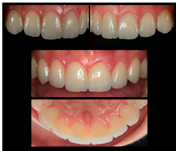
Figure 14. Post cementation check.