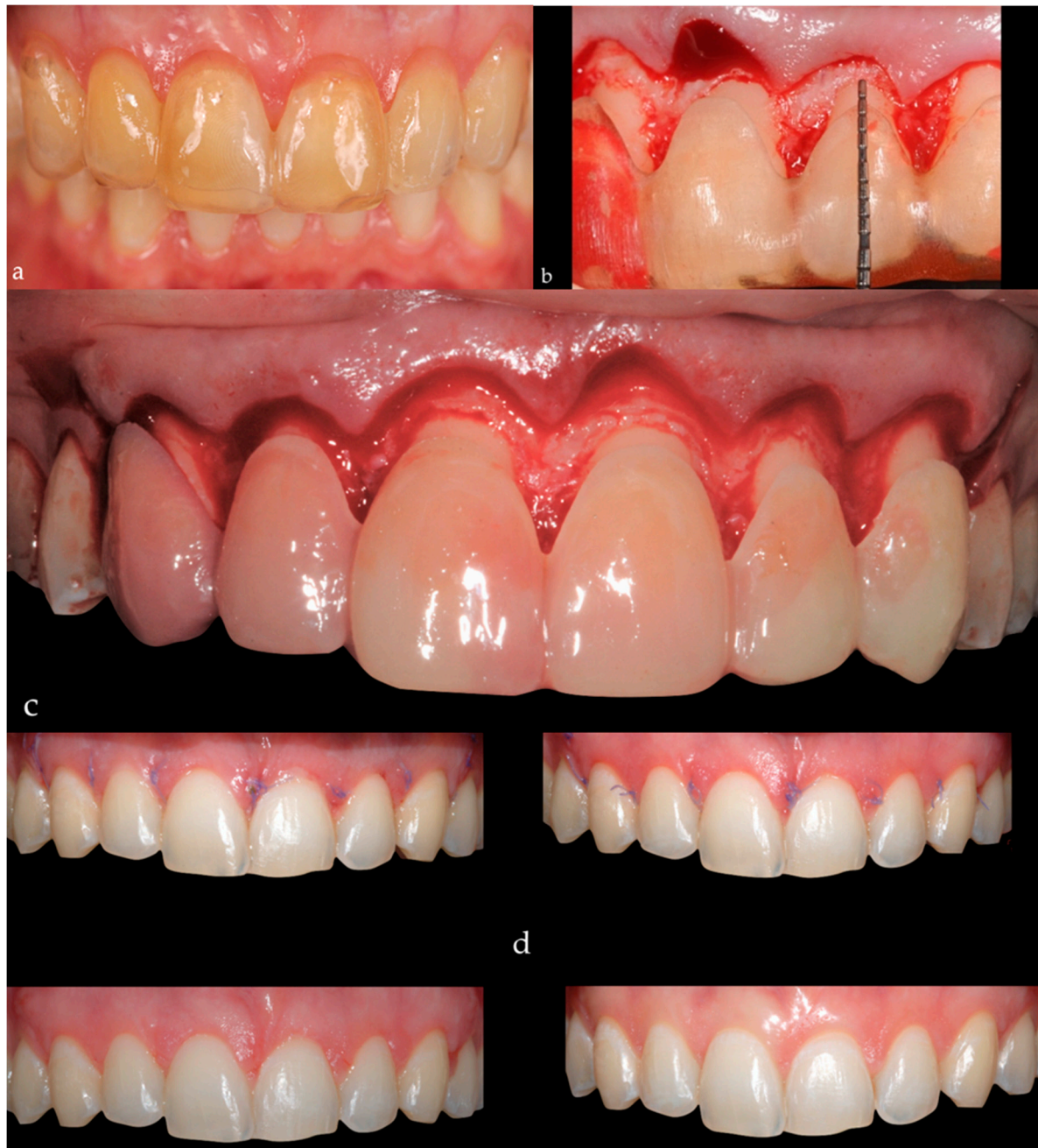
Figure 4. Periodontal surgery phases: (a) mock-up/periodontal surgical guide; (b) biologic width check with surgical guide; (c) biologic width check with mock-up; (d) follow-up (1–6 weeks postop).

After a healing period of 12 months, as suggested by Pontoriero and Carnevale [12], prosthetic phase with preparation of teeth 1.3, 1.2, 1.1, 2.1, 2.2 and 2.3 for porcelain laminate veneers was done. Then a resin mock-up (C&B, A3.5, NextDent B.V.) was applied on the teeth elected for veneer preparations (Figure 5).