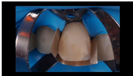
Figure 13. Matrix application on adjacent teeth positioning during cementation phase.