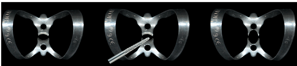
Figure 12. N°9 modified clamp.