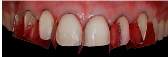
Figure 8. Metal sectional matrixes between teeth before vinyl-polysiloxane master impression.

In order to facilitate the technician in his work, seven small metal sectional matrixes were sprinkled with VPS adhesive and fixed between the anterior teeth and between canines and first premolars before taking the oral impression (Figure 8).