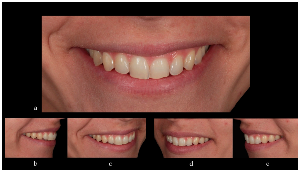
Figure 2. Extraoral photos of the smile: (a) frontal view; (b) right lateral view; (c) three quarter right view; (d) three quarter left view; (e) left lateral view.

A preliminary phase with oral professional hygiene and full mouth disinfection was performed to achieve the health oral conditions necessary to do a correct treatment planning.