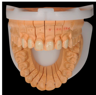
Figure 11. Master model.

The following prosthetic clinical steps for the cementation phase were: