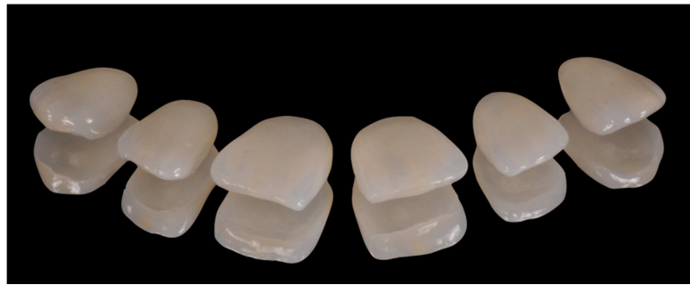
Figure 10. Lithium disilicate veneers.