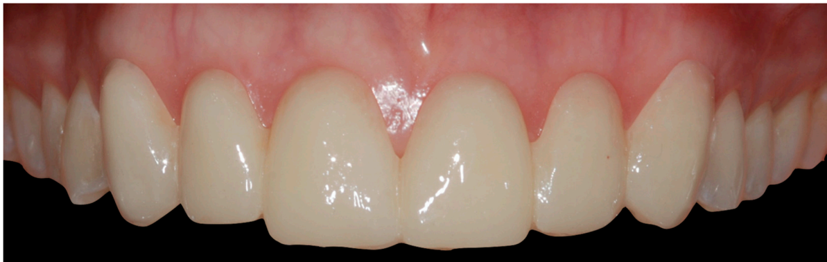
Figure 5. Resin mock-up on teeth elected for veneers.

After trying the mock-up from the esthetically and mechanically point of view, a minimal iuxta-gingival butt joint preparation was done. A reduction of 0.5 mm of the buccal plate and of 1.5 mm of the incisal portion of the teeth added by the mock-up [13] was performed (Figure 6). Teeth 1.3, 1.2, 1.1, 2.1, 2.2 and 2.3 were prepared.