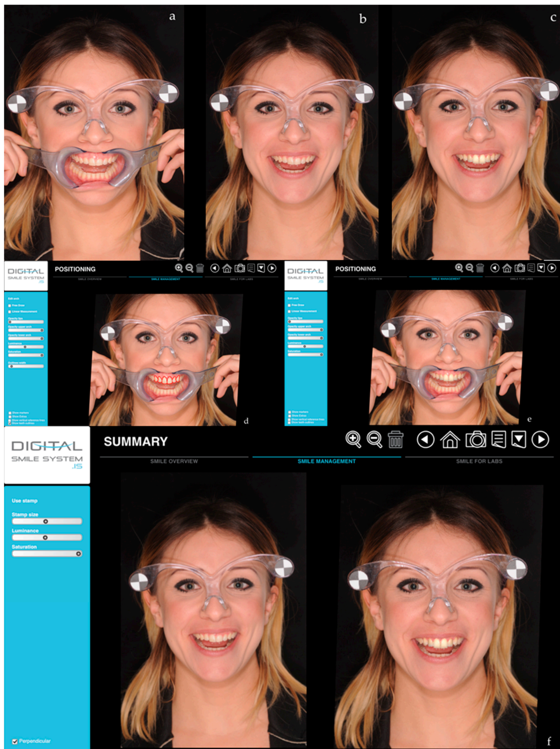
Figure 3. Digital planning with DSS (digital smile system): (a) photo with cheek retractors and DSS glasses during mouth opening; (b) photo with full smile and DSS glasses; (c) virtual digital project; (d) DSS software screen with design outline and final project; (e) DSS software screen with final project; (f) comparison between initial clinical photo and final virtual project.