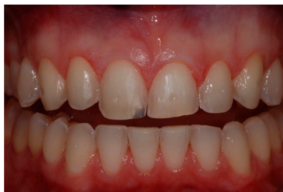
Figure 7. Teeth 1.3, 1.2, 1.1, 2.1, 2.2 and 2.3 prepared. Clinical aspects of dental preparations.

After the buccal plate preparation, a little hole made by a round bur at the center of each tooth was realized in order to ensure the correct positioning of the prosthetic veneers during the cementation phase under rubber dam (Figure 7).