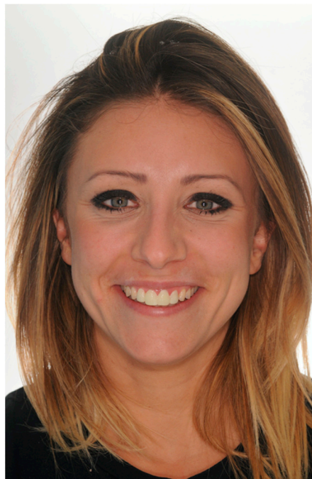
Figure 9. Mock-up for temporary veneers attached by spot-etching technique.

The mockup realized in the first prosthetic phase was used again for making temporary veneers, which were attached on the teeth by using the spot-etching technique (Figure 9).