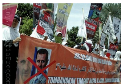
Figure 6. Indonesian members of the Hizbut Tahrir Indonesia (HTI) attend a protest against Syria’s President Bashar al-Assad in Surabaya on 3 March 2012, courtesy Freedom House.