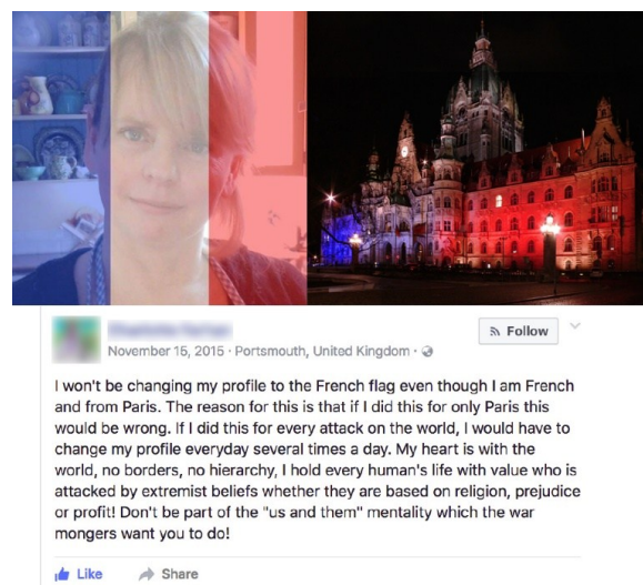
Figure 3. Conflicting approaches to the blue, white and red campaign in support of victims of the terrorist attack in Paris, 13 November 2015.