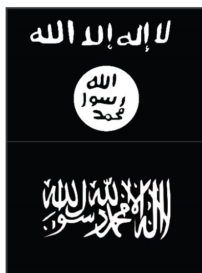
Figure 5. Variant of the flag used by the Islamic State/D’aesh (top) and the Flag of Hizb ut-Tahrir (bottom).

While Da’esh and Hizb ut-Tahrir are both extremist organisations, they represent different extremes on this spectrum. Da’esh is firmly located within jihadi frameworks, while Hizb ut-Tahrir Indonesia stands outside the jihadi milieu. Though they are separate organisations, the similarities in their flags (Figure 5) signal some commonalities in social, cultural and religious values. At a very basic level, both organisations are joined by the notion of Caliphate that breaks down divisions between Muslim countries. Moreover, Hizb ut-Tahrir Indonesia’s active support for Da’esh is indicated in its participation in protests against Syria’s President Bashar al-Assad in Surabaya, Indonesia, in 2012. (Figure 6).