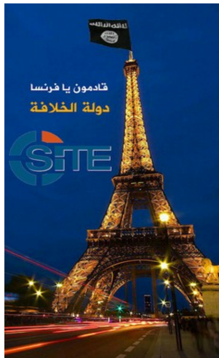
Figure 2. The Eiffel Tower redesigned as a triumphal arch with Da'esh's flag flying victoriously on top.

cultural values between different peoples and widening small fissures. As the blue, white and red activism played out around the globe it began to transform into a symbolic manifestation of an 'us' and 'them' mentality. Such a division supports xenophobic forces, which itself steers recruits towards Da'esh. Muslim countries were in an invidious position: display the lights and be vulnerable to being characterized as lackeys of the West, or do not display the lights and appear unsympathetic to the victims. This question was invidious at a personal level. Many Muslim people, particularly those who are recent immigrants, find themselves exploited and condemned to poverty by neo-liberal economic models. The blue, white and red activism put them into a difficult position. They felt sympathy for the victims. However, they were bitter about how they were being treated by the 'West,' including France.