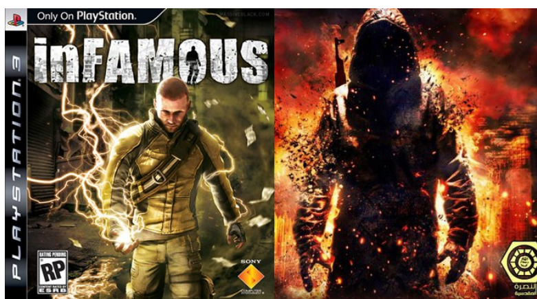
Figure 1. A polished, pre-prepared representation of the Paris attacks by Da'esh, keying into the iconography of video games and the values of the young people who play them.

Informed by such strategies, Da'esh's media outputs concerning the November Paris attacks included a polished and sophisticated image of an intrepid fighter walking away from a Paris that is engulfed in flames. This image keys into the heroic tropes of online gaming, particularly Prototype and inFAMOUS, (Figure 1). In a similar vein, the logo of the Islamic State Health Services (ISHS) mimics that of the British National Health Service (Leander 2016, p. 16). Given a creation strategy of emulation, it is clear that the Paris image was designed to garner new recruits—to turn virtual warriors into actual warriors. The image is inscribed with both Arabic and French text "France under fire."