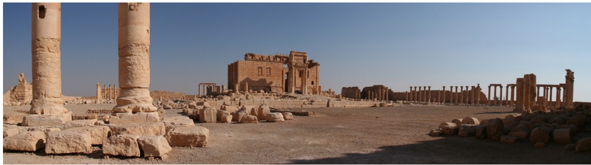
Figure 4. The Temple of Bel, Palmyra, Syria, in December 2008, prior to its destruction by Da'esh in August 2015.

Since this time, vast changes in the media landscape, including the establishment of Facebook in 2004, Twitter in 2006 and Instagram in 2010, have provided new spaces for individuals and groups to express their views without the mediation of a third party. Combined with a transformation in the nature of conflicts, these changes are such that social media can now constitute a threat to cultural heritage. Within this rapidly evolving media landscape World Heritage sites are particularly vulnerable to extremists who seek maximum impact for their political agendas (Smith 2015).