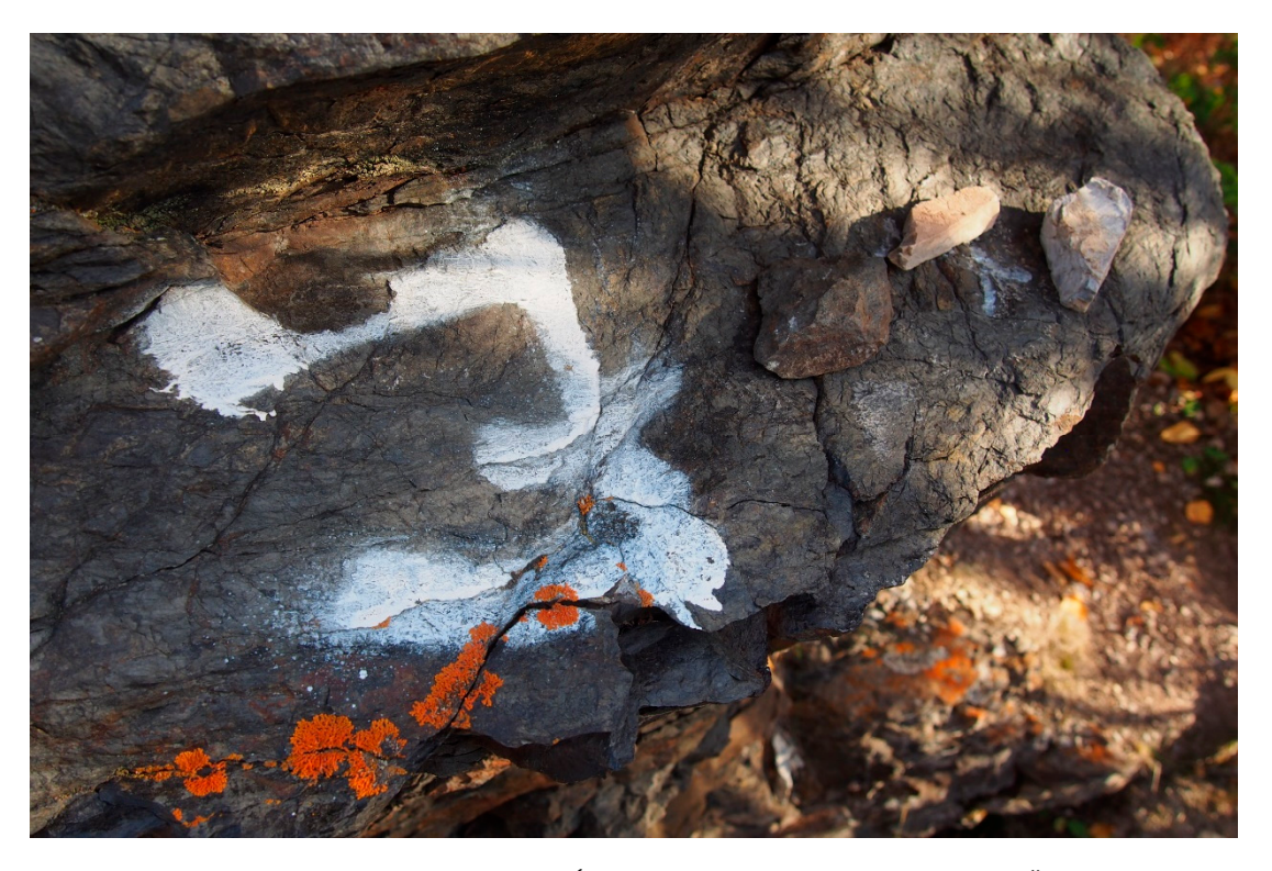
Figure 9. White spray paint on the Áhkku sieidi rock formation.