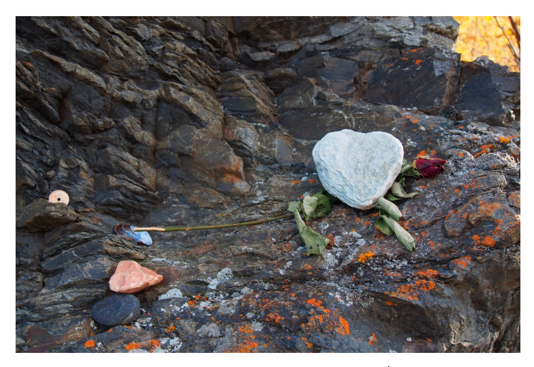
Figure 7. A heart-shaped rock holding down a rose deposited on the Áhkku sieidi rock formation.

A more intentional use of specific objects might be the finds that seem to address amorous wishes, most clearly a single rose placed under a heart-shaped stone (Figure 7). Hearts are also present in the form of a reflector and a small decorative item.