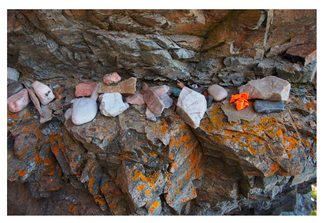
Figure 6. Small rocks placed on the Áhkku sieidi rock formation. (Photo: T. Äikäs).

A more intentional use of specific objects might be the finds that seem to address amorous wishes, most clearly a single rose placed under a heart-shaped stone (Figure 7). Hearts are also present in the form of a reflector and a small decorative item.