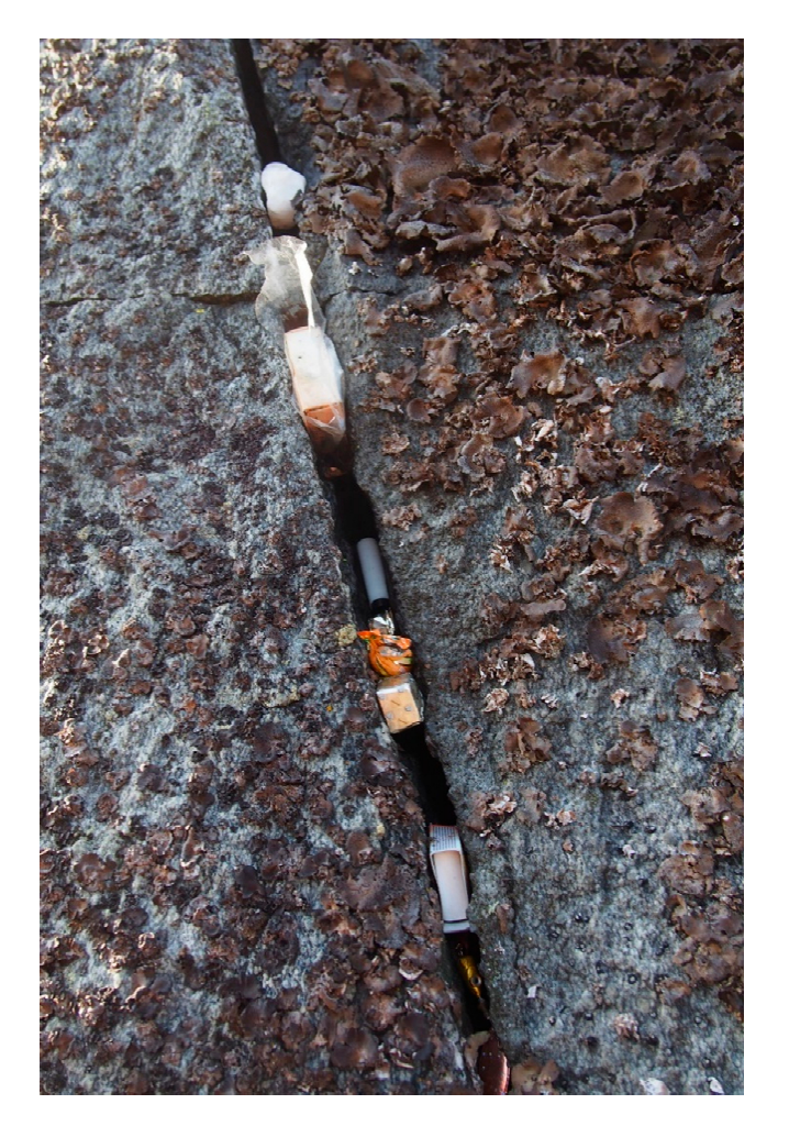
Figure 5. Small objects shoved into a crack in the Fállegeađgi sieidi stone.