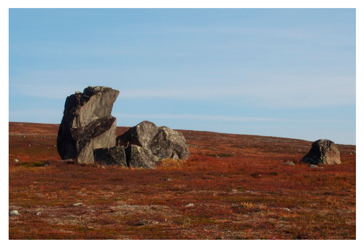
Figure 3. The boulders constituting the sieidi Fállegeadgi. (Photo: T. Äikäs).

The Fállegeađgi rock formation is situated on the northern side of the River Falkelva on a plateau where it can be seen from a long distance. It is relatively accessible by a 9-km walk from the closest road, but, in summertime, the crossing of bogs and small rivers make the hike more demanding than that to Áhkku. In winter, it can be reached on skis. The sieidi consists of three large boulders, one of which is in an upright position (Figure 3). One of the stones has split in two with a narrow crevice between the halves. It is situated on an ancient migration route for reindeer, initially followed by wild reindeer until they became extinct in the 18th-19th century, and subsequently used for reindeer herds by several Sámi siidas (communities).