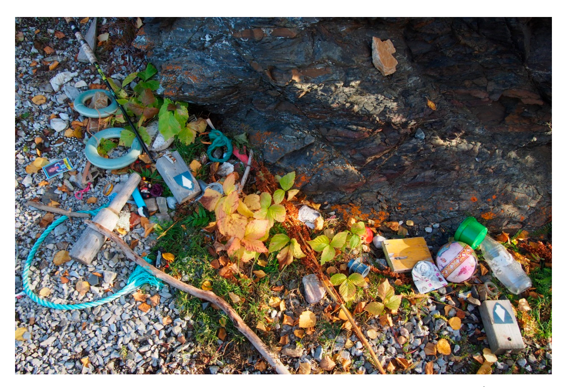
Figure 8. Old signs once marking the path to the site and other objects at the foot of the Áhkku sieidi rock formation. (Photo: T. Äikäs).

a specific object or in the placing of even a mundane object, although it is also dictated by the material of the stone and where different things can be placed. Over the years, it has also been observed that "things move around". Things that are found on the ground in the spring may have been on a shelf the previous autumn and brought back again onto a different shelf the following autumn. Hence, many of the objects are being continuously repositioned on the rock. In some cases, the different items seem to have been deliberately ordered (Olsen 2020). This is quite interesting, as it shows how people do not necessarily leave new things when they visit but find ways of interacting with the site through objects that are already there.