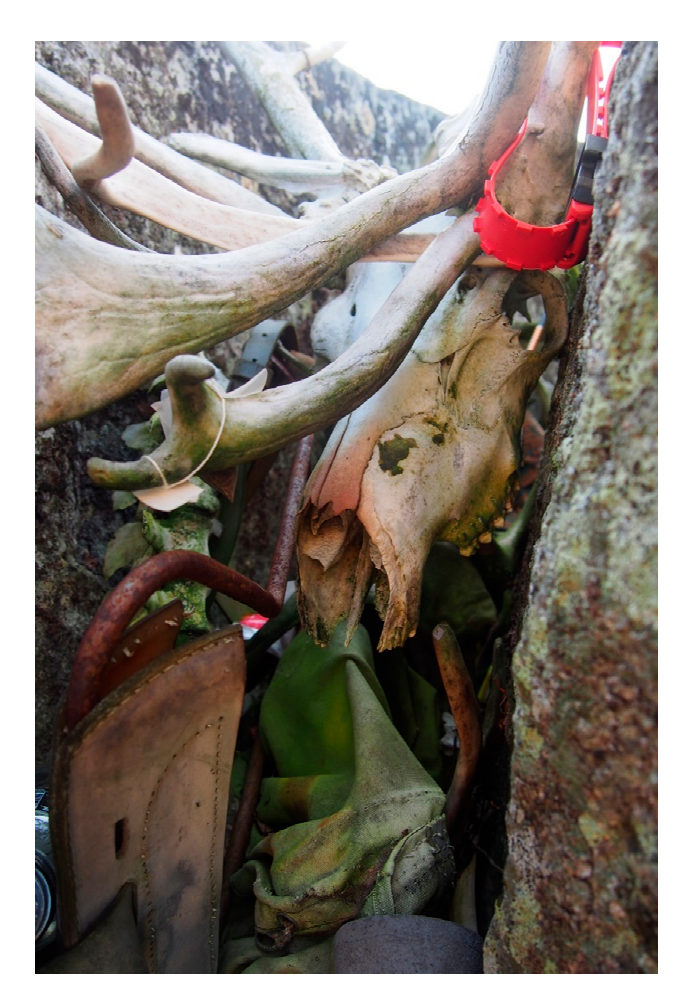
Figure 4. Reindeer skull and other objects deposited in the crevice of the Fállegeađgi sieidi stone.

The finds by the bigger stone are fewer and more heterogenous. Some of them seem to be random leftovers from a hiking trip, like a Coke can on the ground and more deliberately positioned sweets, a matchbox, biscuit wrappers, a biscuit and coins in the cracks of the stone (Figure 5).