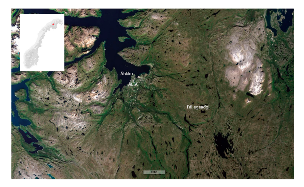
Figure 1. Satellite photo of Alta, Finnmark, northern Norway, with the sites mentioned in the text. Ill.: Marte Spangen.

In this article, we look into the latent conflicts related to the varied contemporary use of two old Sámi offering sites in Alta, Áhkku ("the Old Woman") by the sea close to the town, and Fállegeađgi ("the Falcon Stone") on the inland plains (Figure 1). The study is important to understand the interaction with these sites and what consequences diverging use and understanding of their sacredness may have for the dynamics of the multicultural community in Alta today. Through field observations and semi-structured interviews, we explore who exactly visits the sites and leaves the different things found there, what knowledge various groups have about the original Sámi use of the sites, their own attitude to these today, and how any conflicting use can be mediated at these well-known and easily accessible sacred sites.