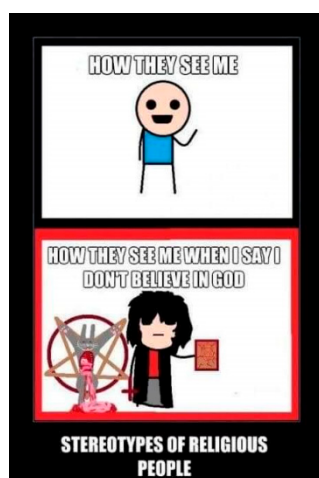
Figure 6.

Other jokes focus on the personal restrictions that non-believers encounter. Figure 7 shows a mother holding the mouth of the “dog” (her child) to not say anything negative or critical about religion in the presence of the rest of the family. In this and other cartoons, social mechanisms such as hchouma , which can be roughly translated as “bringing shame” to oneself or the family, become evident. Furthermore, how to behave correctly during Ramadan has been a topic in jokes for a long time. This can be exemplified by comparing the following two cartoons (Figures 8 and 9), which have been published with around twenty years of discrepancy. 18 The first cartoon poses the question: “You eat during the middle of the day?”, upon which the old man answers: “It’s chewing gum”. The second cartoon portrays two police officers who comment on a man walking down the street: “He’s smiling during Ramadan- that’s suspicious”.