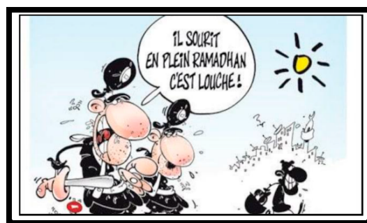
Figure 9. © Dieu, journal Liberté Algérie.

Of course, many members of Facebook groups also make jokes that are not (directly) related to religion, such as memes about former US President Donald Trump. However, a specific kind of humor can be distinguished that criticizes laws based on religious norms, mocks religion, as well as its followers, leaders, and figures, and reflects on clichés and stereotypes about non-believers. This leads to the question: what is the purpose behind these different kinds of jokes? Can we see them as forms of activism or do they have a mere entertaining purpose?