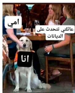
Figure 7. © unknown.

Other jokes focus on the personal restrictions that non-believers encounter. Figure 7 shows a mother holding the mouth of the “dog” (her child) to not say anything negative or critical about religion in the presence of the rest of the family. In this and other cartoons, social mechanisms such as hchouma , which can be roughly translated as “bringing shame” to oneself or the family, become evident. Furthermore, how to behave correctly during Ramadan has been a topic in jokes for a long time. This can be exemplified by comparing the following two cartoons (Figures 8 and 9), which have been published with around twenty years of discrepancy. 18 The first cartoon poses the question: “You eat during the middle of the day?”, upon which the old man answers: “It’s chewing gum”. The second cartoon portrays two police officers who comment on a man walking down the street: “He’s smiling during Ramadan- that’s suspicious”.