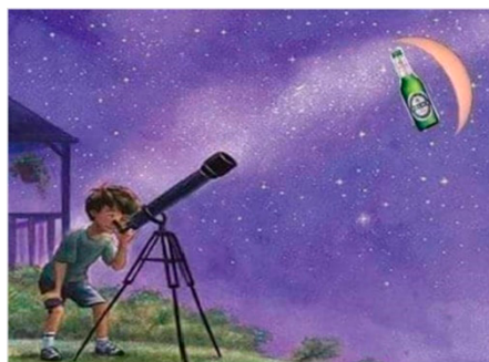
Figure 5.