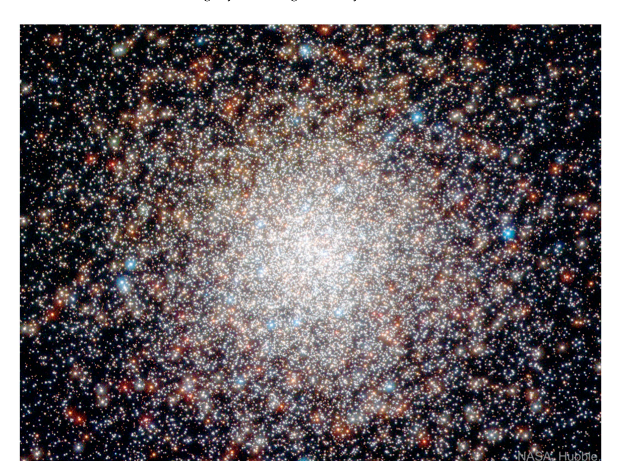
Figure 3. NGC 362, a typical globular cluster.

In a galaxy's central bulge, the density of stars is equal to, or near, that of a globular cluster, a tight grouping of 50,000–10,000,000 stars (see Figure 3). The velocity of the gas in the central bulge is directly proportional to the mass of the galaxy's supermassive black hole. Although this velocity can be difficult to measure, the velocity dispersion of stars in a central bulge can be measured more easily, and astronomers have demonstrated that it correlates tightly with the gas velocity.