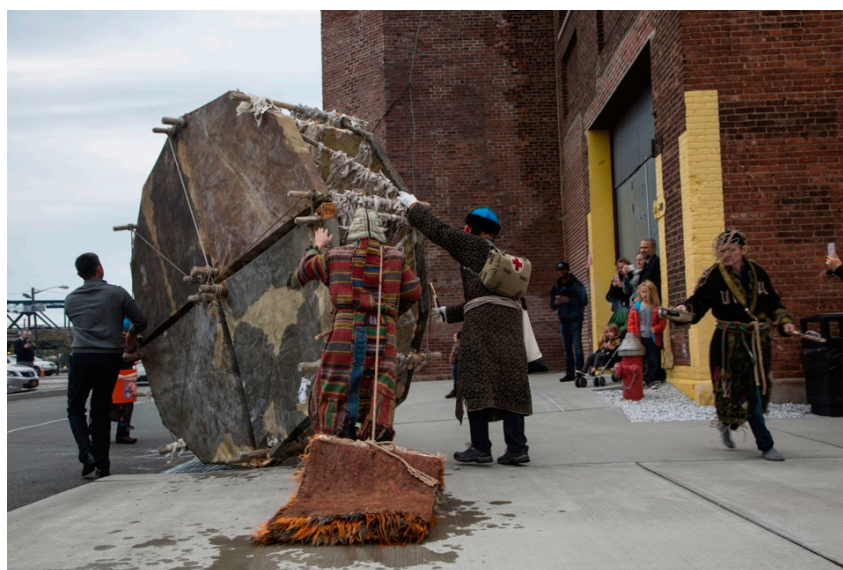
Figure 3. The enlarged shaman's drum on the pavement in front of Mana Contemporary in New Jersey City, USA, during the performance 'Purification'.

extensively discussed in Znamenski's 2007 book, The Beauty of the Primitive: Shamanism in the Western Imagination . It came also to the fore in the response of the American audience to the shamanistic performance, which they termed 'primitive magic'. In an essay entitled 'The shaman reenacted', Parisi (2017) draws attention to this awareness: 'In the past interpreted as an almost ethnographic attempt to rediscover their roots, the work of Kyzyl Traktor instead seems to poke fun at the orientalist stereotypes through which westerners often view Central Asia.' Irony, as we shall see, is certainly part of the work. It fits well with the liminal and ambivalent position of the shaman. Let us now turn to the individual work of Said Atabekov, who exploits the ambivalence of the dervish shaman and uses irony. A case in point is his work on the video 'Neon Paradise' (see here below, Figure 6), which not only demonstrates a technology of enchantment, but also the enchantment of technology (cf. Gell 1992 ).