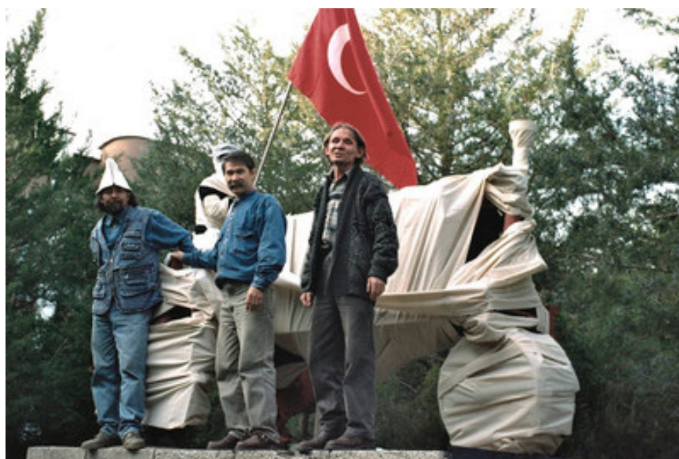
Figure 2. The performance Mummification by the Kyzyl Tractor (Red Tractor) art collective.