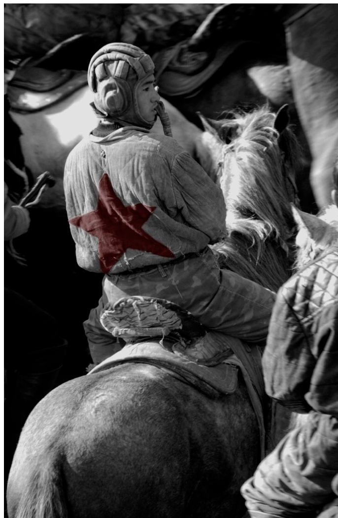
Figure 9. Said Atabekov, Steppen Wolves , 2014.

a particular social group, achieving social equality or even superiority by demonstrating famous logos in their image. Artificial access to the world of high fashion, and therefore to the 'elite', gives an idea of belonging and identification with the 'premier league'. Drawing attention to the cheap, Chinese fake brands, 'Atabekov challenges both the authenticity of contemporary practice that sells itself as "traditional" but also challenges the notion of globalization of Kazakh traditions' (Kudaibergenova 2018, p. 447).