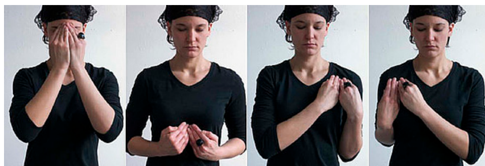
Figure 12. Said Atabekov, Bosphorus Prayer, 2007.

from the religious practice of both Christianity and Islam. A woman performs this ‘fundamental ritual’ (Mauss [1909] 2003, p. 24). With the gestures of her hands in motion, she makes a cross, which refers to Christianity; however, the way she holds her hands is characteristic for Muslims when they pray (Figure 12). ‘Bosphorus Prayer’, with the non-verbal language of prayer, was part of the works from four of Atabekov’s projects shown at the 54th Venice Biennale in 2011. The exhibition in the Central Asian Pavilion had the telling title of ‘Lingua Franca’. By means of the ‘Bosphorus Prayer’, Muslims and Christians can be seen as reconciled in their worshipping.