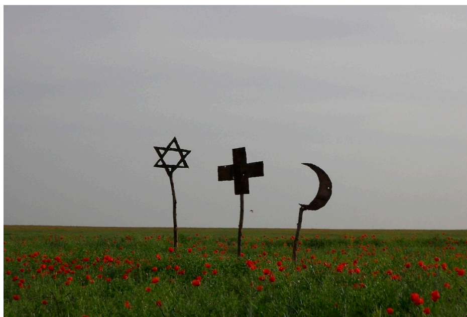
Figure 10. Said Atabekov, The Way to Rome , 2007–2015.

In Figure 11, Atabekov portrays a man who is carrying a crescent-shaped object as a burden on his shoulder. He walks through the steppe. His shadow shows the sun light the ‘moon’, carried in full daylight. The work is part of the series ‘The Way to Rome’. The man carrying the (sacred) object on his shoulder is reminiscent of the iconic image of Jesus Christ carrying his cross. It also signals that a hegemonic, monotheistic religion has made inroads in the steppe, in this case, scriptural Islam. Atabekov seems to suggest that the descendants of the steppe people carry this type of Islam as their cross in contrast to the syncretic and informal, mystical Islam of the dervishes.