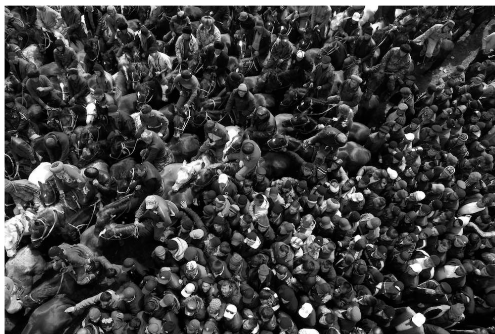
Figure 8. Said Atabekov, Kokpar #2 , 2013.

Further pursuing the theme of kokpar , Said Atabekov presents a series of works entitled 'Steppen Wolves' (2014). These focus on the riders playing the game in order to emphasise certain aspects, such as heroes, colours and paraphernalia. Said Atabekov's photography (Figure 9) of a rider sitting on a horse with a red star on the back of his jacket and a tank helmet shows a 21st century man who is living in the era of globalisation and in a culture of consumerism. Following the globalisation of fashion, riders sew logos of famous brands with errors, such as Prada, D&G and AirAstana, for their identification of involvement in