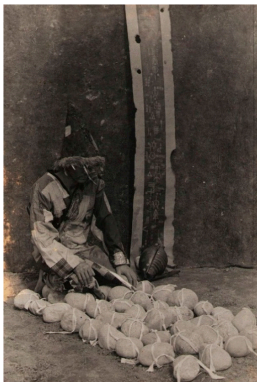
Figure 5. Said Atabekov, Prayer Rug, 1998, from the series The Dream of Genghis Khan-2.

he 'captures the video several times over from a computer screen in order to obtain a trash quality, which suggests the antiquity and timelessness of the narration.'