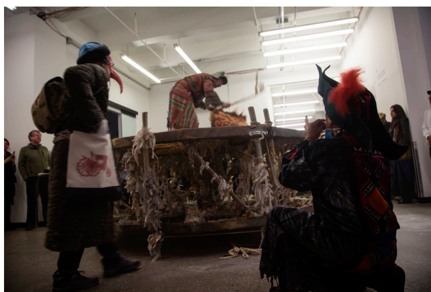
Figure 4. Members of Kyzyl Traktor in shamanic attire performing a ritual cleansing with an oversized shaman's drum indoors in the galleries of Mana Contemporary in New Jersey City, USA.