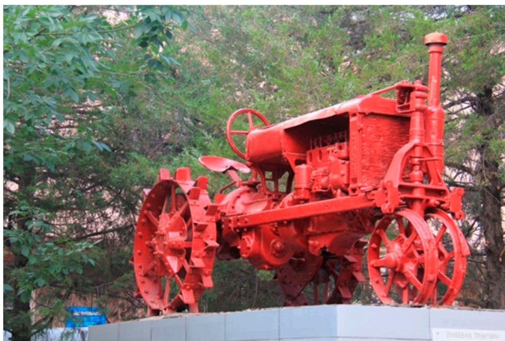
Figure 1. The Red Tractor monument on a pedestal at the South Kazakhstan Regional Museum of History and Local Lore in Shymkent.

In 1990, the Kyzyl Tractor collective covered up the machine, the red tractor on the pedestal, in a performance called ‘Mummification’ (Figure 2). The gesture entailed an artistic appropriation, expressed by the group’s name of Red Tractor, reminiscent of the well-known work of contemporary artist Christo (Christo Vladimiroff Javacheff) who used to wrap landmarks in fabrics. The performance’s title suggests that by means of a symbolic plastering and bandaging of the red tractor, this model of technical progress was to be preserved for centuries.