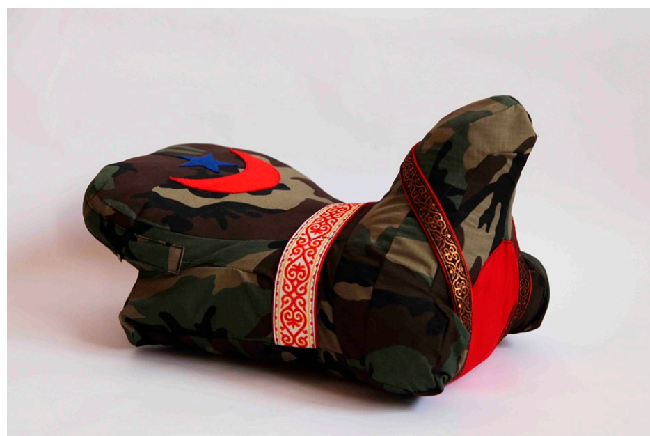
Figure 13. Said Atabekov, Zhusan, 2019.

In Atabekov’s oeuvre, however, we see that religion not only unites but also divides. His 2019 art project ‘Zhusan’ (Figure 13) deals with militant Islam. Zhusan is the Kazakh word for “bitter wormwood”, which has been a revered plant of the Great Steppe since ancient times, a sacred element of traditional Kazakh culture. In his artwork ‘Zhusan’ (Figure 13), Atabekov covers a horse saddle with military camouflage clothing and the symbols of Islam. In an interview, he offered the following comment on this work: ‘toy for children, and pillow for adults’ 9 . Since time immemorial, Kazakhs have been raising cattle and using the horse as their primary mode of transport. Therefore, horse equipment, with the saddle as the most important item, held a special place in Kazakh life. The saddle was not only an object of material value but was also treated as something of sacred significance. The lack of a saddle in the house was considered a shame (Tokhtabaeva 2017, p. 15).