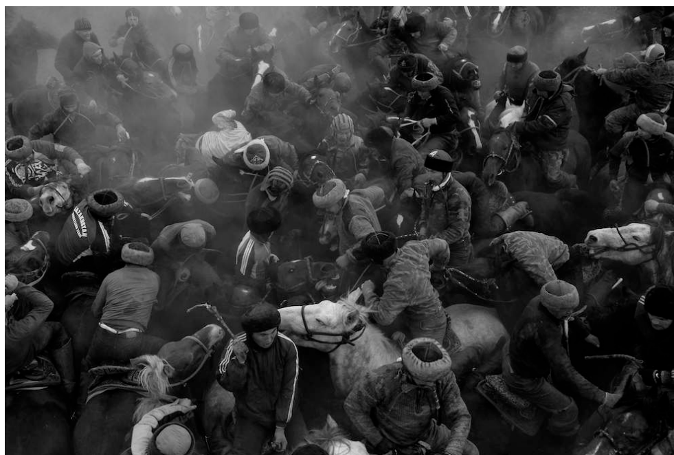
Figure 7. Said Atabekov, Battle for the Square , 2013.

governed by fierce competition' (Atanova 2020). Furthermore, for Atabekov, the game 'is just like a religion, where people pray to God before the start, asking for the blessings' 7 .