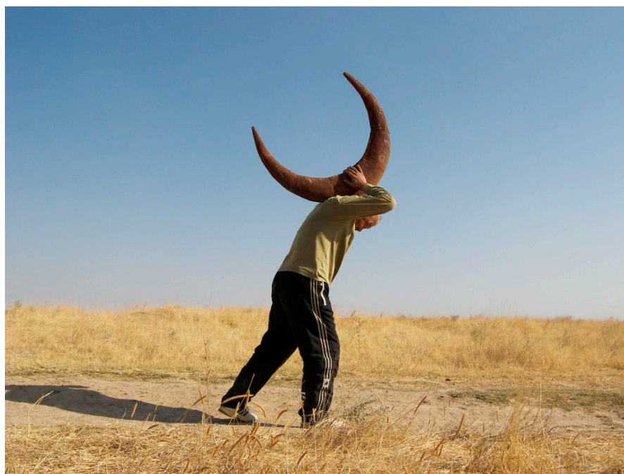
Figure 11. Said Atabekov, The Way to Rome , 2007–2015.

In Figure 11, Atabekov portrays a man who is carrying a crescent-shaped object as a burden on his shoulder. He walks through the steppe. His shadow shows the sun light the ‘moon’, carried in full daylight. The work is part of the series ‘The Way to Rome’. The man carrying the (sacred) object on his shoulder is reminiscent of the iconic image of Jesus Christ carrying his cross. It also signals that a hegemonic, monotheistic religion has made inroads in the steppe, in this case, scriptural Islam. Atabekov seems to suggest that the descendants of the steppe people carry this type of Islam as their cross in contrast to the syncretic and informal, mystical Islam of the dervishes.