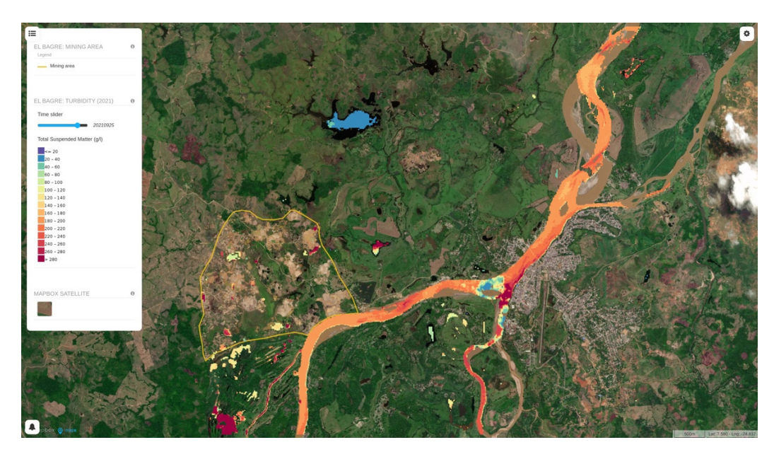
Figure 3. Screenshot of the MapX layer developed for the study area covering the city of El Bagre overlaid on high resolution satellite imagery.