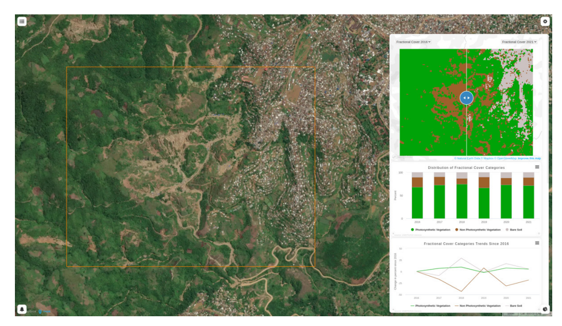
Figure 1. Screenshot of the MapX layer developed for the study area covering the Bipasi and Kazibe mines.

3.899&lng=20.376&z=5.256&viewsListFlatMode=true&language=en, accessed on 2 June 2022) was developed in MapX to visualize land cover changes in an interactive and comprehensive way (Figure 1).