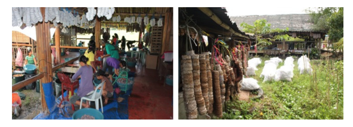
Figure 4. The actual field production test at the Uswag Calajunan Livelihood Association, Inc. (UCLA) Center and the briquettes produced, hanged for drying.

These three different rates were representative of three different possible productivities for workers; hence, the total production divided by the number of days and number of participants would illustrate the average production rate per person. The first mode represented an output-oriented worker who can increase his/her income if he/she can produce more. The second mode represented a worker who was willing to earn that much, but if he/she wanted to increase his/her fixed income, then he can produce more so that he/she can have a bonus. The third type represented a worker who does not really mind the volume he/she can produce as long as he/she is paid a fixed amount of money. The estimation of the fixed rate at 150 pieces per day was based on the average briquettes produced during previous briquetting tests conducted [27].