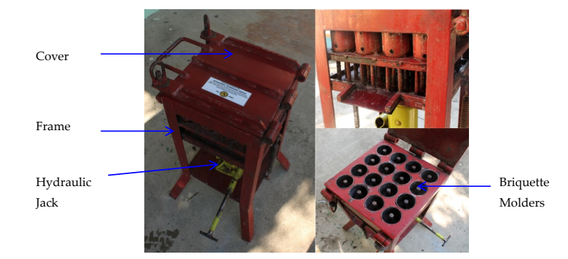
Figure 1. The hydraulic jack-driven briquetting machine utilized in the briquette production test.

The mixed biomass materials, which were first prepared separately, were placed into each of the cylindrical molders until totally filled. The molder's cover was then closed and locked by the bolts, then compressed by the 10-ton capacity bottle-type hydraulic jack. Once the materials were compressed, the cover was opened, and the jack was thrusted again until the materials were pushed out of the molders.