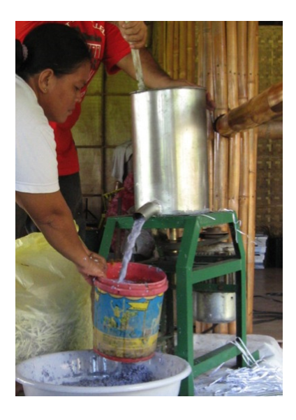
Figure 2. The pulping machine utilized during briquette production showing the wet pulped paper produced.

The pulping machine as seen in Figure 2 is necessary for making the waste papers disentangle and become homogenous. During the field test when there was no electricity supply, production continued even without the use of this machine. The quality of the briquettes was, however, not satisfactory. Therefore, for every operation, the use of this equipment was emphasized. The pulping machine is driven by a 1-Hp capacitor-start single-phase electric motor. The machine was designed to have this size in terms of electric energy consumption, so that it would not create heavy electrical load during operation. The device operates like a blender, where the shredded papers or manually stripped papers are loaded inside the cylinder of the machine. The cylinder is then filled with water, just enough to soak the paper loaded inside. The electric motor is turned on until a homogenous mixture is attained. The length of the pulping operation depended on the volume of paper loaded inside the machine. The pulped papers were then screened to remove excess water. The use, however, of wet pulped waste papers in briquette production requires the briquettes to be further sundried for at least 7 days to make it suitable as dry fuel.