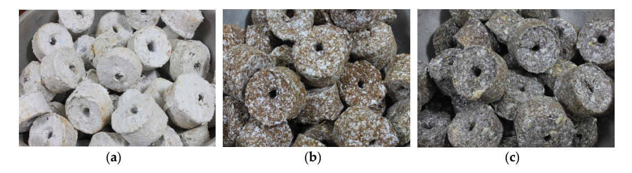
Figure 5. Types of briquettes produced using biomass wastes, from left to right: (a) paper (P); (b) paper + sawdust (P + SD); and (c) paper + sawdust + carbonized rice husk (CRH) (P + SD + CRH).

Table 1 and Figure 5 display relevant facts and quality parameters of briquettes produced using three different input materials obtained from the municipal waste stream. They were cylindrical in shape with a hole at the center. The briquettes in the first column appeared mostly white because these briquettes were produced from waste papers as the only input material of this fuel. The briquette types shown at the center of Figure 1 were light brown in color with traces of white spots. This appearance was due to the presence of 50% waste paper and 50% sawdust. In the third column, the presence of CRH resulted in a darker color of the briquette, but waste paper components can still be recognized as white and light brown color specks.