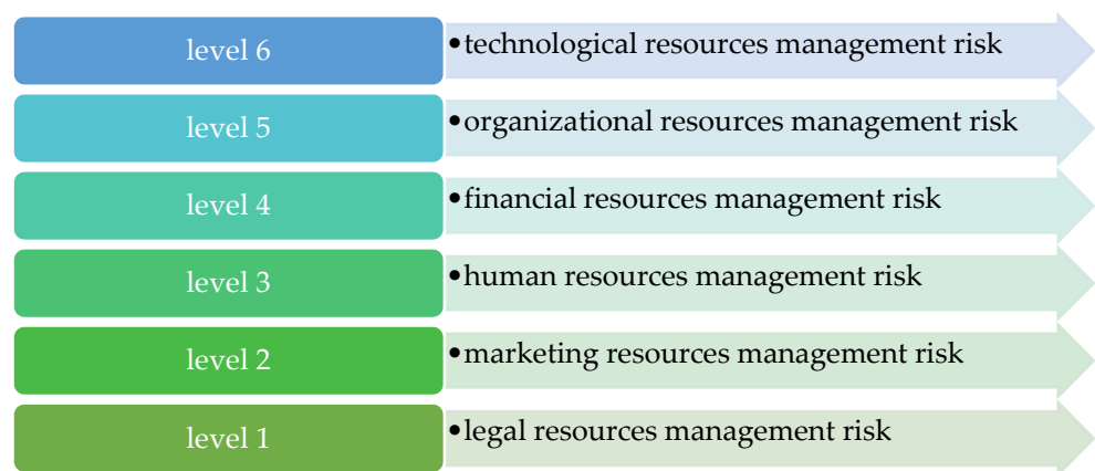
Figure 2. Risk levels of company resource management.

The development of a competence structure for the enterprise resource management risk described in the article is a starting point for further research. The presented study opens up possibilities of application verification of the created model for its further development. Research should be conducted in two directions. First of all, the research may shape human capital according to its resource management's identified competence areas. Secondly, the research should include practical recommendations to formulate and implement managers' risk management strategies. To this end, given managerial competence in creating company value, management practitioners and researchers should develop research for building risk management models. Risk competence in a highly volatile environment is the strategic capital of employees. Enterprises that bring together valuable people should encourage the creation of new competence models. Managers' competence models should consider people's skills when assessing the risk of managing the company's resources.