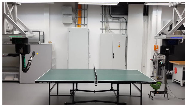
Figure 1. Robot table tennis setup used to evaluate the proposed methods. We use four cameras attached to the ceiling to track the position of the ball. The robots used are two Barrett WAM robot arms capable of high speed motion, with seven degrees of freedom like a human arm.

In the real system, we evaluate the error distribution of the proposed system and compare it with previous work [8]. We show that the proposed framework is clearly superior in accuracy and robustness to outliers. Finally, we evaluate the system by using a robot table tennis policy [9] that was designed to be used with the RTBlob vision system [8]. We remove all the heuristics to detect and remove outliers from the policy implemented [9] and still obtain a slight improvement of performance compared using the proposed vision system. Figure 1, shows the real robot setup used on the experiments, executing the policy proposed in [9] with the vision system proposed on this paper.