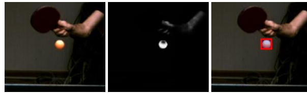
Figure 3. Ball detection using a single convolutional unit in a semantic segmentation setting. The image on the left shows a section of a table tennis scene. The image on the center shows the probability image B representing the probability assigned to each pixel of being the ball. Dark means low probability and bright means high probability. The image on the right shows the detected ball position. This simple model can successfully find the ball in the image, and it is around 50 times faster than the SSD method.

The throughput of the single 5 \times 5 convolutional unit is about 50 times higher than the throughput of the SSD method on the same hardware with our implementations. As a result, we decided to use the single convolutional unit as the ball detection method, achieving the necessary ball observation frequency and accuracy for robot table tennis. In Section 3, we analyze in detail the performance and accuracy of the single convolutional unit. In addition, we compare the accuracy of our entire proposed system with the RTBlob vision system [8] and evaluate the playing performance of an existing robot table tennis method [9] using the proposed system.