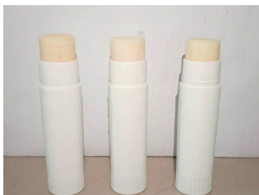
Figure 1. Nigella sativa Balm Stick.