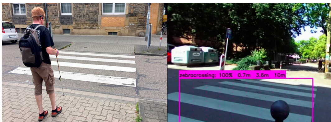
Figure 1. Detection of zebra crossings by analysis of the current environment 3 (photographs: D. Koester, Screenshot).

Thus, people with blindness or vision impairments as well as mobility trainers are included in the technical development process in order to assure demand-oriented approach technology development in the sense of co-design—at the beginning of the project, a requirement analysis was carried out on current research literature on the needs of people living with blindness and vision impairment. In addition, mobility trainers were interviewed about mobility challenges in urban space for blind and visually impaired people. On the basis of this analysis, a first functional demonstrator was developed, which is tested and evaluated in a user study in the middle of the project. The results of this user test flow into the further development of the system. Finally, towards the end of the project there will be a second user 4 study to evaluate the achieved status of the assistive technology 5 .