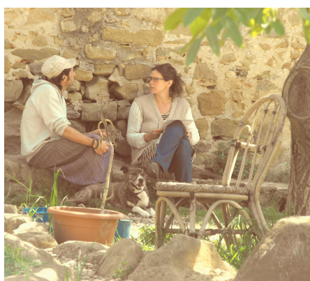
Scheme 2. The fieldwork. This photo was taken during one of the semi-structured interviews at one of the Ecological Intentional Communities in north Catalonia.

The 29 testimonies were recorded then transcribed and analysed with RQDA (Huang 2009), open-source software for qualitative data analysis. As a result, a coded list of items was produced, in line with our research interests. Field notes were also coded to complement the interview data.