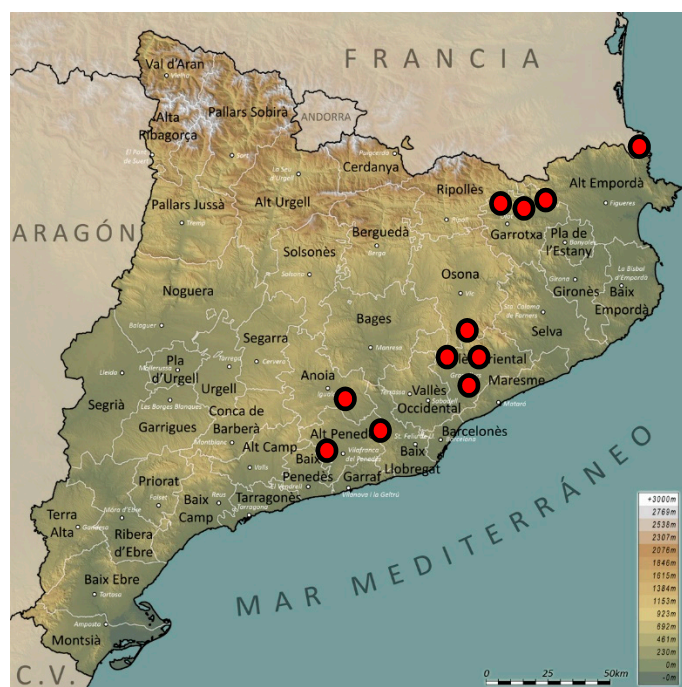
Scheme 1. Location of EICs where we conducted interviews. The scheme shows the approximate geographic distribution in Catalonia of the Environmental Intentional Communities used for data collection through interviews. Each red circle symbolizes a community.

In order to understand more fully the motivations that led people to be part of an eco-community in Catalonia, we analysed testimonies from 29 informants in 11 different eco-communities. The data collection is detailed below. Scheme 1 shows the communities distribution used for data collection.