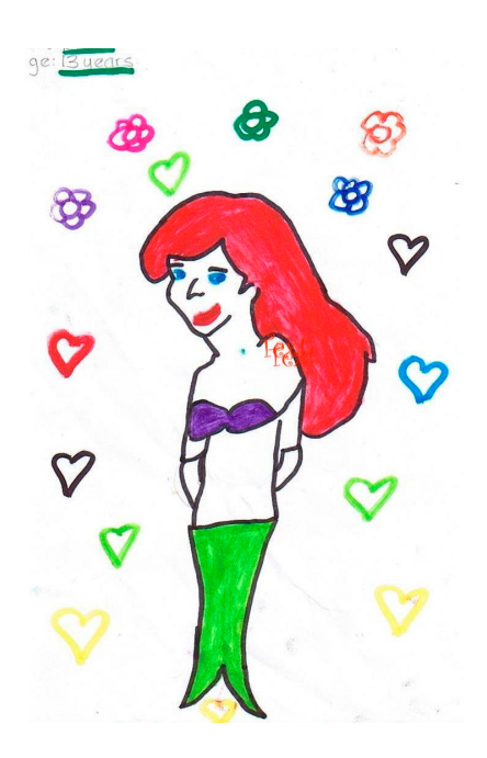
Figure 10. Fiji Mermaid 13–15.