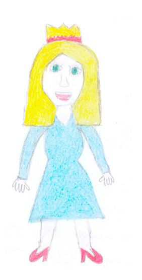
Figure 7. Sweden, Business wear & Crown 13–15.

Notes: The percent of princesses that were drawn with light skin by country.