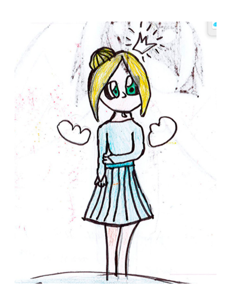
Figure 8. Sweden 8–10 Business Wear & Crown.

Transnational media is critiqued for mainstreaming western beauty ideals, and aiding in deracinating young girls from their own culture. None of the participants in nonwestern countries, i.e., India and Fiji, drew princesses wearing traditional outfits, or with any cultural accessories such as anklets or nose ring for India and shell or flower jewelry in Fiji, that represented their respective national cultures (RQ#1). Both in India and Fiji, not only were all the princesses drawn in western outfits or as