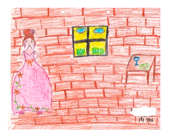
Figure 15. India, Gown 13-15.