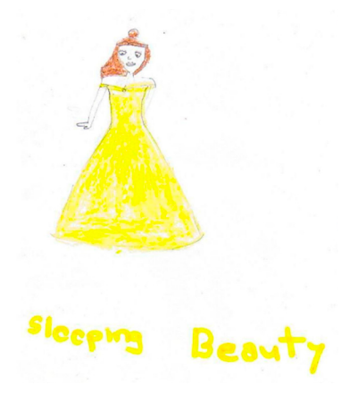
Figure 2. Fiji Sleeping Beauty 8-10.

In Fiji, despite viewing movie clips of nonwestern princesses, six of the 11 girls in the 8–10 years group and three of ten in the 13–15 years group drew the Little Mermaid with long red hair, two participants in the 11–12 age group titled their drawing Sleeping beauty, and one in the same age group called hers a Cinderella, indicating the popularity of these movies (Figure 2) (RQ#2). None of the participants in Fiji, where straight hair is rare among Fijian girls, drew princesses with curly hair (Figures 11 and 12). Instead, medium to long straight hair was common, three of 26 drawings had blonde hair and eight of the nine mermaids drawn had red hair, none of which are Fijian traits (Figures 9 and 10) (RQ#2). One image in Fiji (Figure 11) had long blonde hair that almost covered the whole image. Similarly, Figure 3 from India and Figure 7 from Sweden show similarly prominent yellow hair. Although only one of 16 drawings of princesses from India had blonde hair, seven of 16 were drawn with auburn or brown hair, rather than black, the more common hair color in India (Figures 6 and 13) (RQ#2).