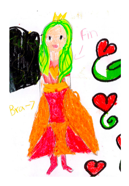
Figure 4. Sweden 8-10.