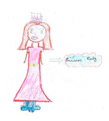
Figure 12. Fiji Straight Hair 11–12.