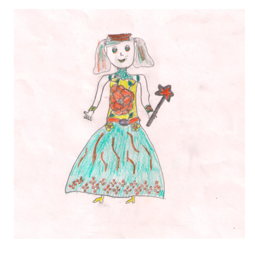
Figure 14. India, Gown & Wand 13–15.