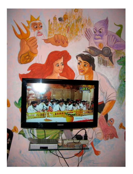
Figure 1. Scenes from Little Mermaid on a wall in a house in India.

North America, Latin America, and Middle East, and two of which are countries with large populations, India and Russia. The website lists India, a country of 1.3 billion people, with a growing market that consumes much media in English, as a separate market from Asia<sup>3</sup>. Each tab has a drop-down menu that takes the viewer to country and language-specific content. Each region is further divided into many subregions and countries. In essence, Disney is everywhere. If not in theatres, then it can be found on electronic screens that are omnipresent, or as logos and images, posters and book covers, theme designs for birthday cakes, and even professionally painted onto the walls of young children's rooms<sup>4</sup> (Figure 1).