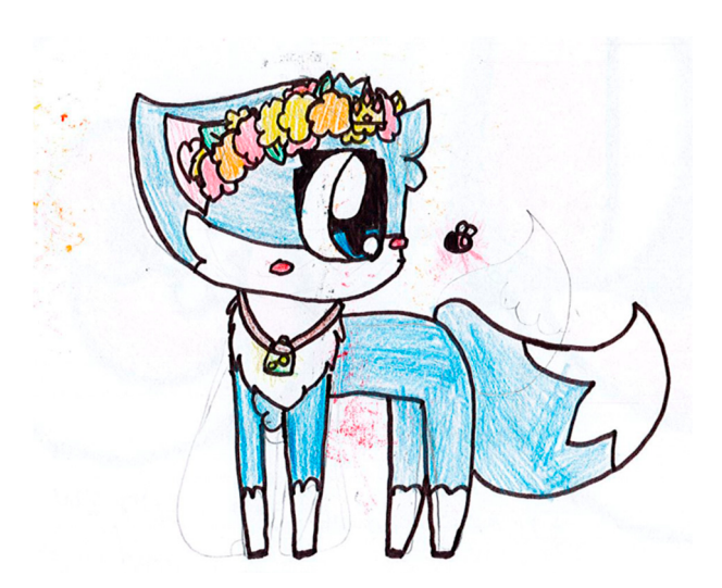
Figure 16. Sweden Cat Princesses 8-10.

Many participants in Fiji and India were not familiar with Aladdin, Mulan , and Pocahontas before the study, but almost all had seen classic Disney princess, namely Cinderella and Snow White, which explains why heels and wands were the most common accessories drawn in both the countries. The three main colors used across the countries were pink, red, and blue, followed by yellow and green (RQ#2). Black, a color often used in Disney movies to depict evil, was used the least in dresses or accessories. No princess was drawn wearing trousers, even in India, where loose trousers are both casual and formal wear.