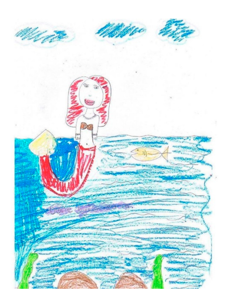
Figure 9. Fiji Mermaid 8–10.