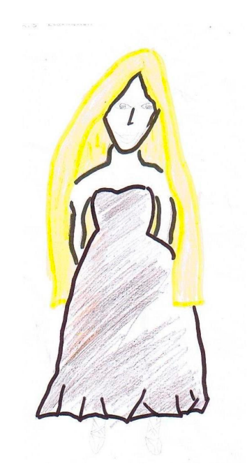
Figure 11. Fiji Long Hair 13–15.