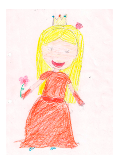
Figure 3. India Crown Blonde 8-10.