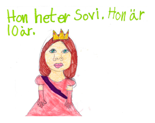
Figure 5. Sweden 8–10.