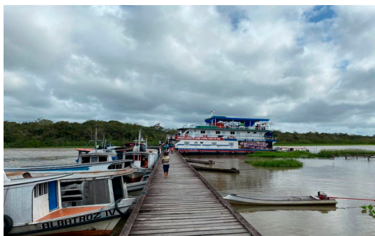
Figure 2. A photograph depicting the primary access route for the local population of Boca do Una to the “Itinerant Citizenship” initiative, showcasing the boats of the community members. In the background, the UBS boat, utilized by the researchers for accommodation, is visible.

The data collection transpired during our involvement in the “Itinerant Citizenship” initiative, carried out in the riverside communities of the Pará Amazon, specifically, Itapéua and Boca do Una, both of which are situated within the jurisdiction of Porto de Moz, Pará. This initiative was orchestrated under the guidance of the local judge and unfolded on 22 and 23 March 2023. Throughout the research period, the researchers were aboard a UBS boat—the municipal basic health unit—made available through a collaborative effort between the judiciary and the local city hall. The boat was the means used by the “Itinerant Citizenship” action to enable those involved to reach out to the riverside populations, as shown in Figure 2.