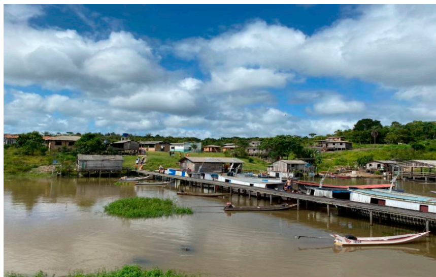
Figure 1. A photograph of the arrival at the Boca do Una community in the municipality of Porto de Moz.

The data collection transpired during our involvement in the “Itinerant Citizenship” initiative, carried out in the riverside communities of the Pará Amazon, specifically, Itapéua and Boca do Una, both of which are situated within the jurisdiction of Porto de Moz, Pará. This initiative was orchestrated under the guidance of the local judge and unfolded on 22 and 23 March 2023. Throughout the research period, the researchers were aboard a UBS boat—the municipal basic health unit—made available through a collaborative effort between the judiciary and the local city hall. The boat was the means used by the “Itinerant Citizenship” action to enable those involved to reach out to the riverside populations, as shown in Figure 2.