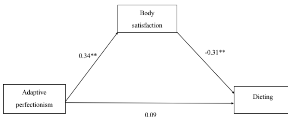
Figure 1. Beta coefficients as indicators of the association between adaptive perfectionism, body satisfaction and dieting in female participants ( n = 79 ). * p < 0.05 . ** p < 0.01 .