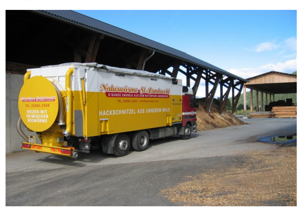
Figure 4. New truck for wood chip delivery: "woodchips from our forest" (© Naturwärme St. Lambrecht).

These people did not allow technical problems to stop them either. When some end users seemed to prefer oil over wood chips because of the dust emitted by the filling of wood chip bunkers in private homes, the proponents of wood-based heating systems linked up with researchers from a provincial research institute and developed—with funding from national R&D programs—a lorry with an improved pumping device for dust-free filling of wood chips bunkers (see Figure 4). They also invented a new service model which allowed end customers to pay just for the heat (in kWh) without having to consider the quantity or quality of the fuel.