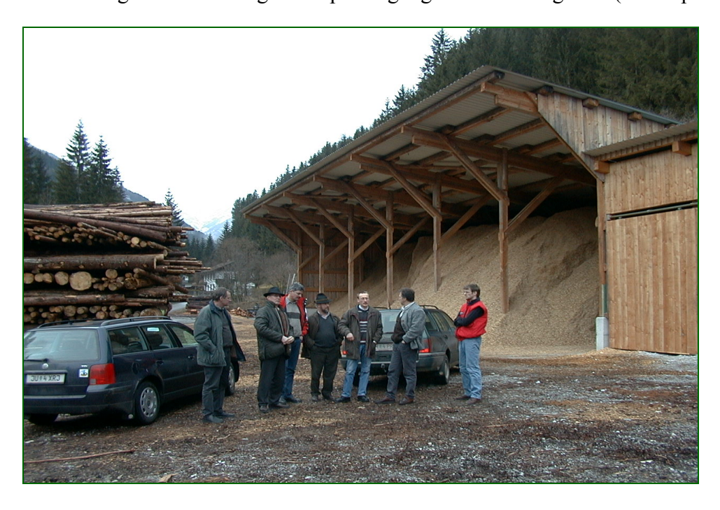
Figure 3. Farmers taking on the challenge of improving regional wood logistics.

Closely related to this second story-line is the often conveyed self-image "we are very pragmatic people and get things done" and the imperative: "... if we all stand together!" To "take action" is often contrasted with "just talking" and the preference is clear: social status, particularly of men (see Figure 3) in this rural and alpine context, very much depends on how certain the community can rely on individuals' commitments with regard to financial and workforce contributions to joint efforts.