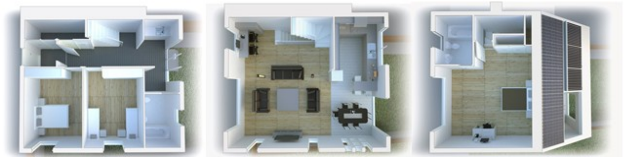
Figure 2. Ground, 1st and 2nd floor plans of ZEMCH 109.