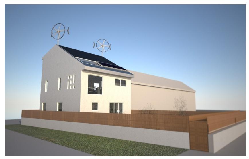
Figure 1. ZEMCH 109 equipped with a south-facing photovoltaic/thermal (PV/T) roof.