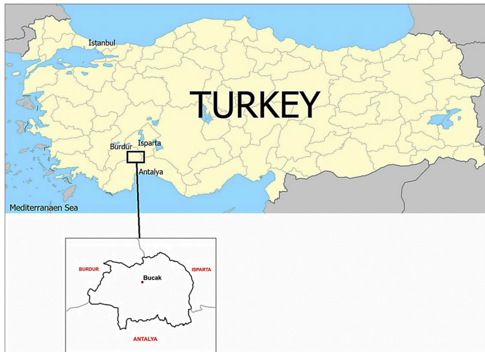
Figure 1. Location of the Bucak region's Model Forest in the eastern part Burdur province in Turkey.