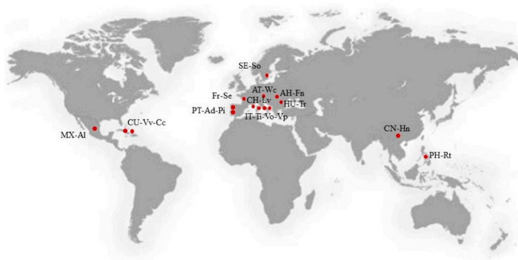
Figure 1. Localization of the rural World Heritage Sites analyzed.

The WHC currently includes 176 States Parties. To date (February 2015), the WHL includes 1007 properties (779 cultural, 197 natural and 31 mixed) located in 161 Countries. Overall, 46 properties are considered in danger, and two have been delisted. Analyzing the World Heritage List, we have identified the landscapes that today constitute rural World Heritage Sites. In particular, up to 2015, UNESCO has recognized 16 rural landscapes around the globe as cultural heritage sites and deemed them to be of OUV. Their characteristics are described in Table 1 and their localization in Figure 1. In the present study, only the core zone (the protected area) was considered.