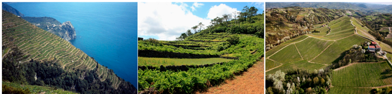
Figure 2. Three viticultural landscapes, IT-Ti ( left ), PT-Pi ( center ) and IT-Vp ( right ), recognized as cultural heritage by UNESCO.

Analyzing Table 4, we can observe that all rural sites are characterized by specific and OUV elements. For example, although IT-Ti, PT-Pi and IT-Vp (Figure 2) are viticultural landscapes, they show distinctive features and unique elements. In fact, these sites are characterized by traditional wine growing, but the environment, the cultivation and production systems, the agricultural practices, the cultivated vineyards and the used terraces/walls are different.