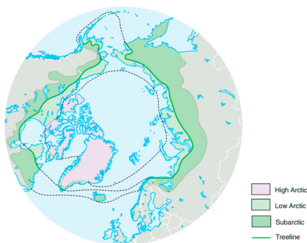
Figure 1. Arctic and subarctic floristic boundary to delimit the terrestrial Arctic by the treeline [29].

A common definition of the Arctic is the area north of the Arctic Circle ( 66^{\circ}32' N ), approximately outlining the southern boundary of the midnight sun. Alternative definitions are based on temperature (the area north of the 10^{\circ}C July isotherm), vegetation or oceanographic characteristics, while Arctic Monitoring and Assessment Programme (AMAP) applies a geographical compromise (Figure 1) delimited by the treeline (trees not growing beyond the northern limit) [29].