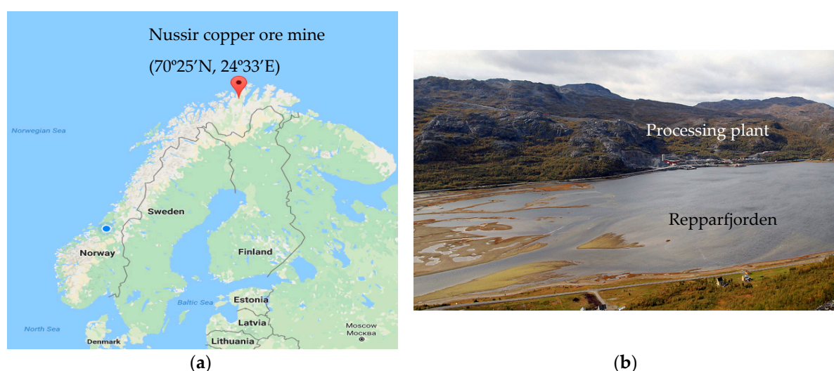
Figure 2. (a) Location of the Nussir copper ore mine on Google Map; and (b) a natural landscape view of the Nussir mineral processing plant adjacent to Repparfjorden, northern Norway.

This case study aims to identify the contributions of local emissions to the LCIA results at both midpoint (environmental problems-oriented) and endpoint (damage-oriented) levels. A cradle-to-gate LCA was carried out, beginning with raw material and energy production and ending with copper concentrate ready for delivery. To investigate the relative contribution of emissions from transport of copper concentrate, we included shipping from Port Hammerfest to Port Rotterdam (with a distance of around 2500 km) in this study, assuming that half of the total emissions from shipping was released in the Arctic region. The functional unit assumed for this study was 1 kg of copper in copper concentrate. The produced copper concentrate at this mine contains approximately 45% copper and a small amount of silver and gold. The allocation of environmental burdens between the product and co-products (i.e., copper, silver and gold in copper concentrate) was based on their economic values, namely copper 82.8%, silver 11.6%, and gold 5.6%.