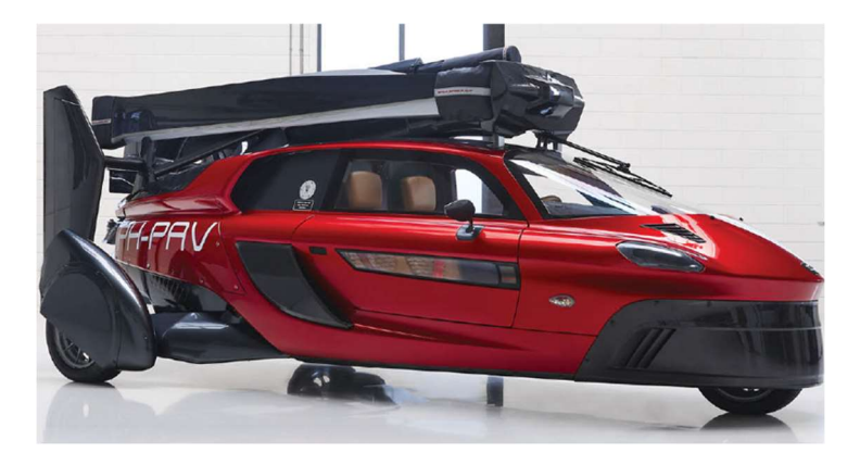
Figure 4. The Dutch Pal-V Liberty flying car [90].

Several enterprises work on flying cars, whose aesthetic recalls Spinners [89]. Indeed, current prototypes include vertical take-off and landing (VTOL) aircrafts or drones made of lightweight but resistant materials and with improved power density engines. The first commercially available flying car, the Dutch Pal-V Liberty, can already be reserved (Figure 4). It was presented at the Geneva Motor Show 2018. According to its developers, it takes 5–10 min to change from a three-wheeled car to a gyroplane and reaches 160 km/h on the road and 180 km/h in the air, at a maximum height of 3500 m. For its part, Uber plans to launch an aerial taxi service in 23 cities across 13 countries by 2020. Other firms, such as Google (with the start-up Zee.Aero) or Airbus (Vahana), are behind similar projects. Flying cars attract governments as well as traditional car manufacturers. Dubai plans to introduce a flying taxi at the World Fair in 2020, whereas Toyota supports a group of Japanese inventors to launch a flying car (SkyDrive) by the 2020 Summer Olympics in Tokyo.