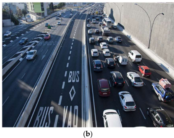
Figure 2. Dynamic versus static high-occupancy-vehicle (HOV) lanes: (a) adjacent HOV lane; (b) segregated HOV lane.