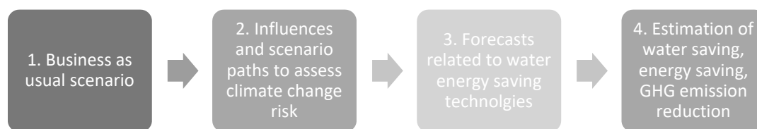
Figure 3. Methodological steps.

To collect information on the efficiency and suitability of implementing WEST initiatives in the context of Cuenca, primary data were collected along with the review of secondary sources. This information was essential to develop the hypothetical scenario needed for understanding the potential impact WEST could have in achieving sustainable urban water management in the urban water cycle of Cuenca. A Business-as-Usual (BAU) scenario was developed based on the analysis of the three different variables: residential water flows (variable 1), energy demand (variable 2), and GHG emissions (variable 3). Projections were then made to evaluate the BAU scenario over the time frame 2015–2030. Table 1 below specifies the variables and related indicators used in the study.