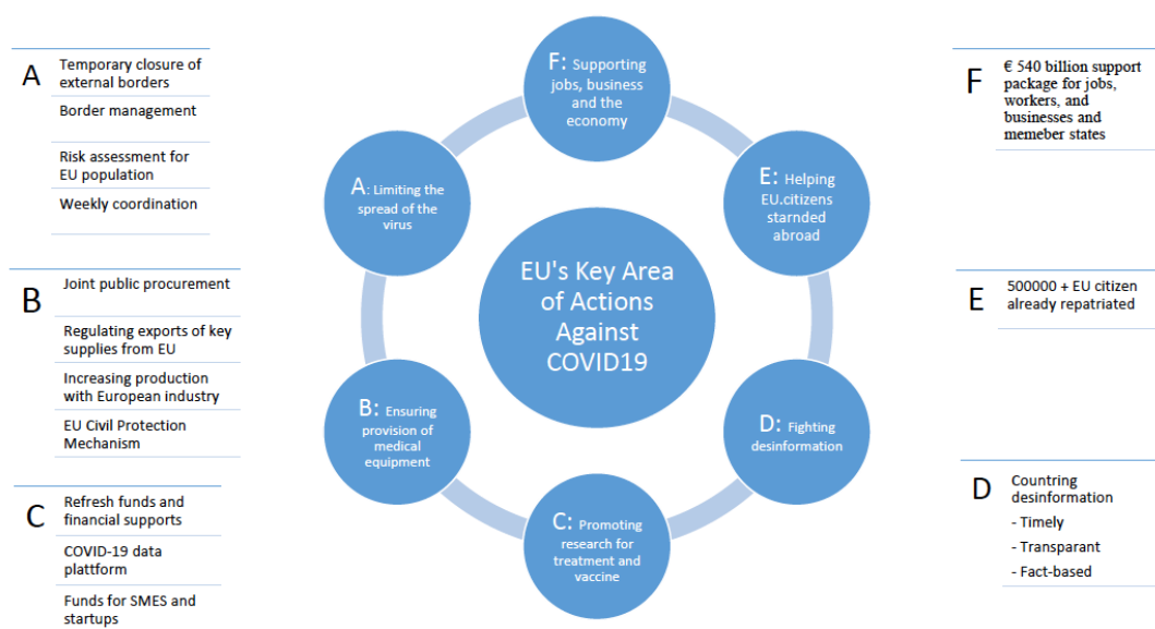
Figure 2. The EU's emergency response to the COVID-19 pandemic.