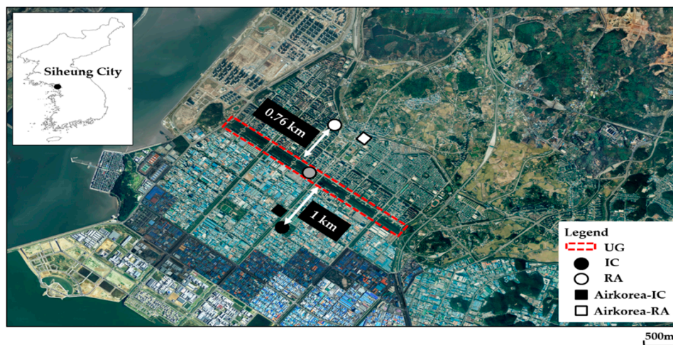
Figure 1. The location of measuring points and national atmospheric environmental research station in Siheung City, Gyeonggi-do, Republic of Korea (modified from map.kakao.com). IC: industrial complex; UG: urban green area; RA: residential area; Airkorea-IC: national atmospheric environmental research station located near IC; Airkorea-RA: national atmospheric environmental research station located near RA.

where C_{IC} is PM concentration in IC and C_{RA} is PM concentration in RA.