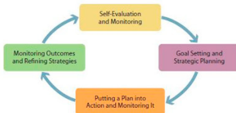
Figure 2. A model of self-regulated learning.

and especially teachers' support by providing opportunities to become more self-regulated and by monitoring students' learning to facilitate the students' experience with the transition and to help the children sustain the self-regulated learning process.