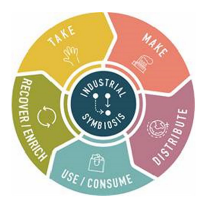
Figure 1. Action fields in the Circular Economy paradigm [6].

been coined [5] for applying CE principles to processes or products. Figure 1 shows the different areas of implementation of CE.