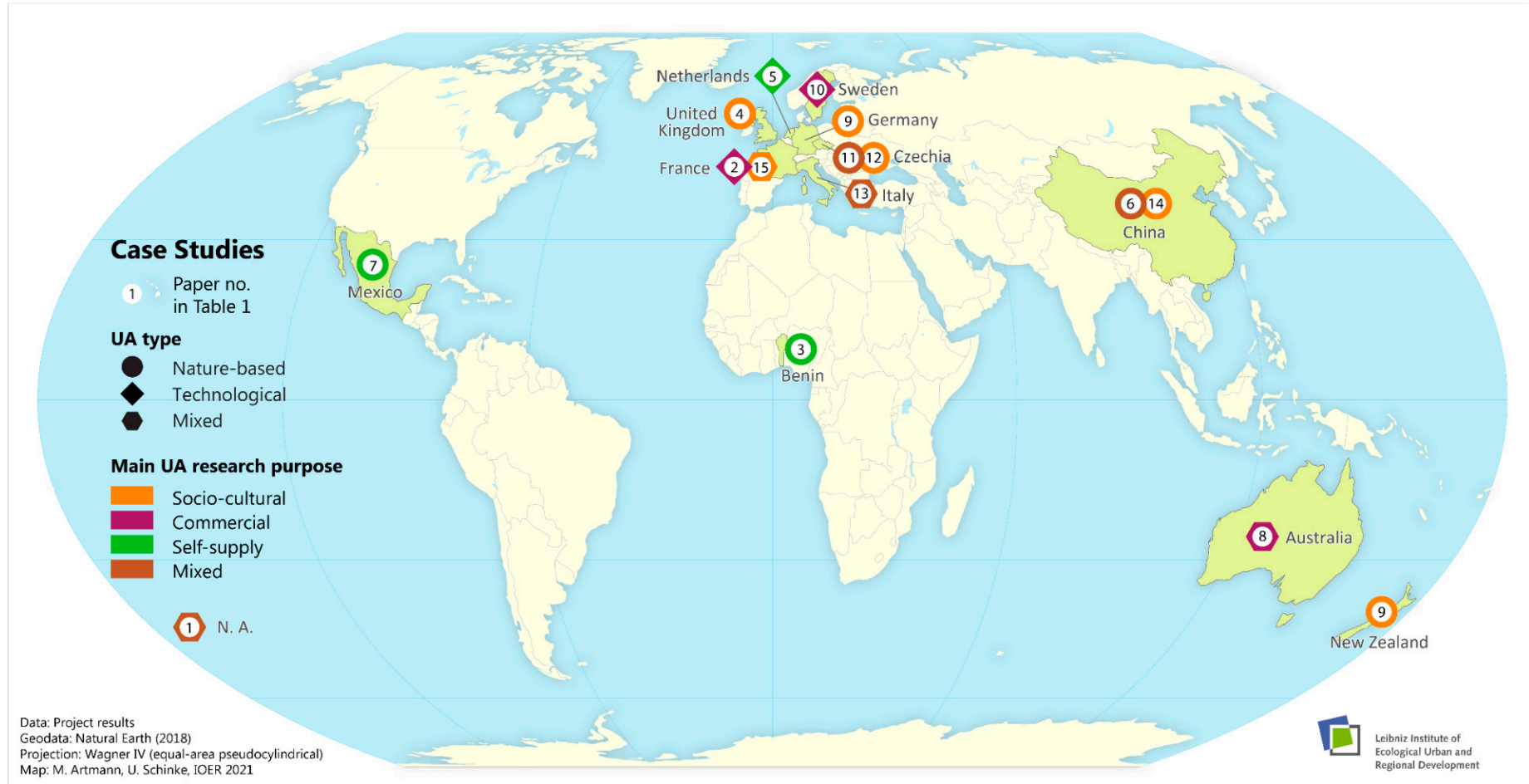
Figure 1. Geographical distribution of studies presented in the Special Issue (Note: Paper no. 1 [38] refers to a conceptual paper and has no geographical context).