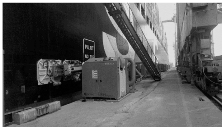
Figure 1. Automatic mooring system using vacuum cups in Salalah.

In the port of Salalah, it was decided to install an AMS because the system can work with generators independent of the electric network and because the monsoon season, which usually begins in July and lasts three months, brings with it swells, low visibility, and a unique set of challenges for that port (see Figure 1).