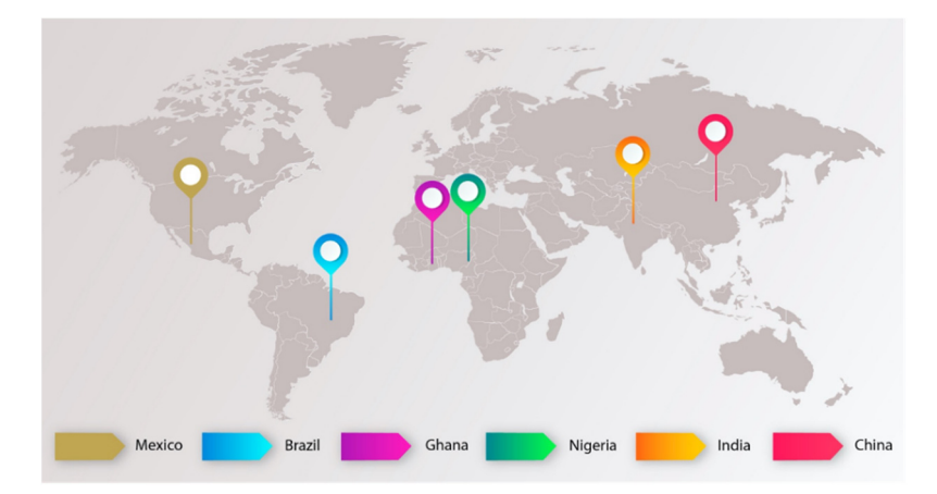
Figure 1. Study sites.

The issue of e-waste as an existing environmental problem across three major continents (Asia, Africa and Latin America) is analysed, particularly for the locations most vulnerable to e-waste dumping (Figure 1). Two countries have been then selected from each of the continents: Mexico and Brazil in Latin America, Ghana and Nigeria in Africa, and India and China in Asia. These choices are based on a combination of factors, including the total amount of e-waste that is exported to each country as well as the amount of e-waste generated internally. There is specific focus on some cities that receive exceptional quantities of e-waste, such as Agbogbloshie in Ghana which has been described as the most polluted e-waste site on earth [37], and Guiyu in China which is considered the electronic graveyard of the world [38] because of its informal e-waste recycling.