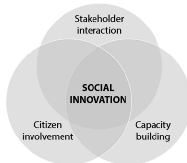
Figure 1. Social innovation approaches relevant for PED development, own figure based on [13].

respective urban districts therefore asks for a balanced approach towards innovation that is combining technological and social dimensions [39].