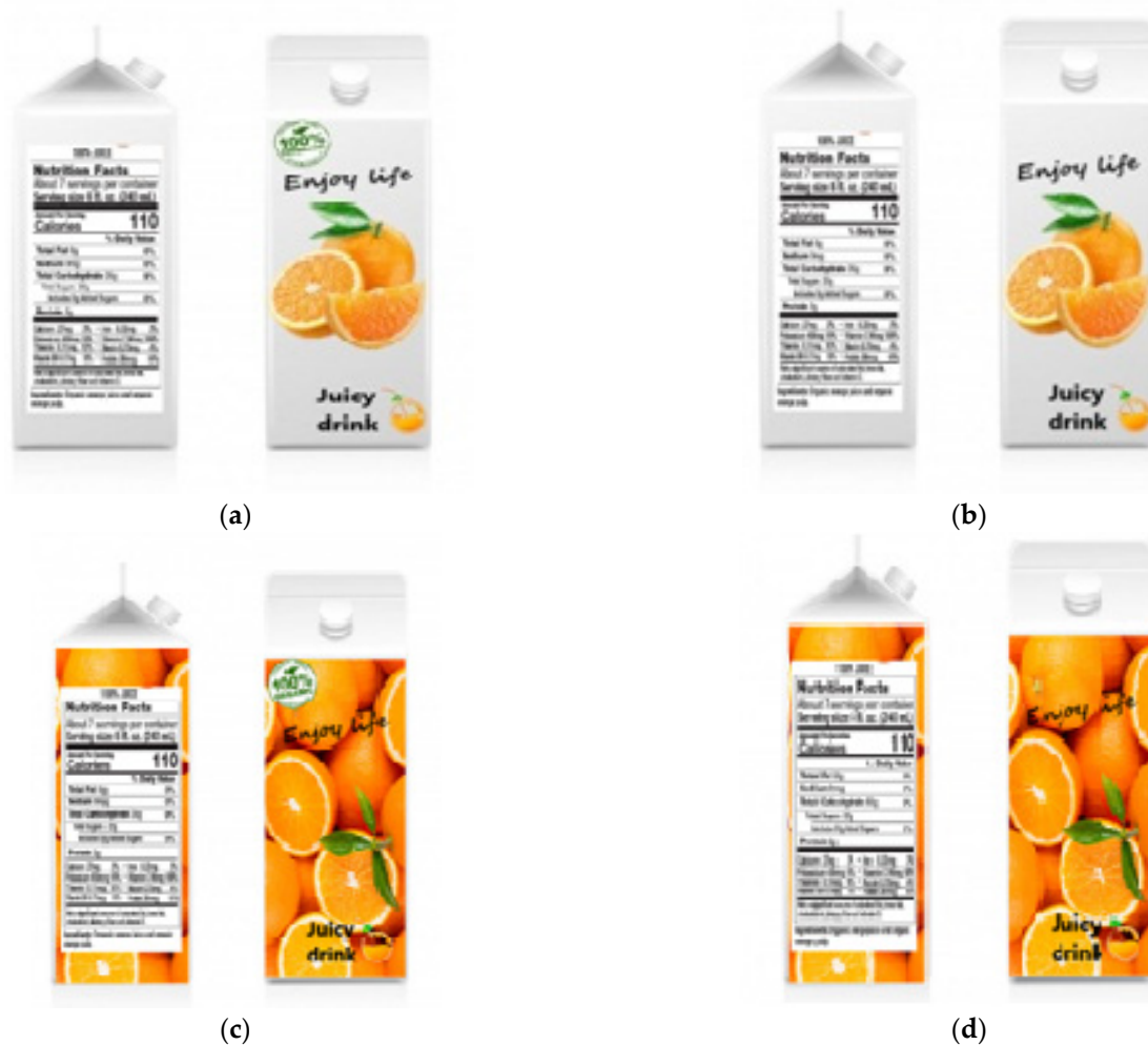
Figure 2. Experimental stimuli of Study 2. (a,b) extended “white” space, and (c,d) limited “white” space.

“white” space against the size of ad image, resulting in two versions of packaging with respect to “white” space, the extended and limited “white” space condition.