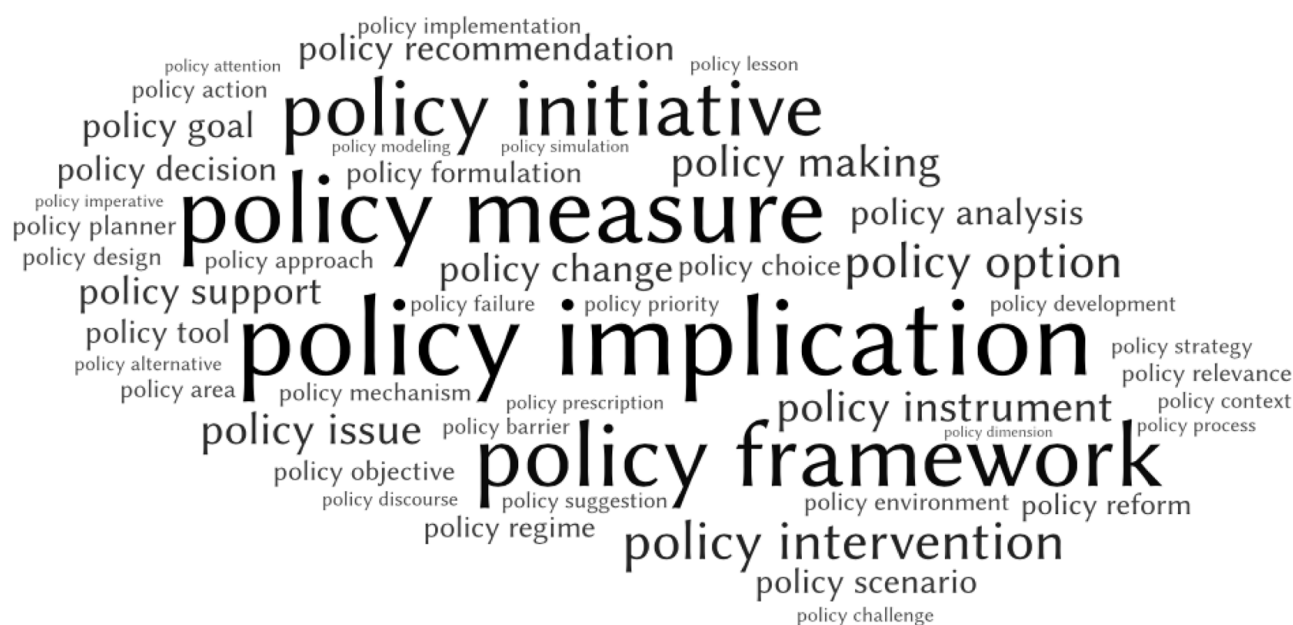
Figure 4. A word cloud representing public policy concepts occurring in three or more publications. The figure is created using WordArt. Available online: https://wordart.com (accessed on 20 September 2021).

examining whether and how policy instruments work in practice is, however, limited. In an example of this type of work, Kathuria [103] assesses the impact of the mandate for the use of compressed natural gas as the fuel for public transport on air pollution in Delhi. In another example, Quitzow [169] proposes an analytical framework of policy strategy to account for the presence of multiple policy instruments in a typical policy package and applies it to study the performance of the national solar mission in India.