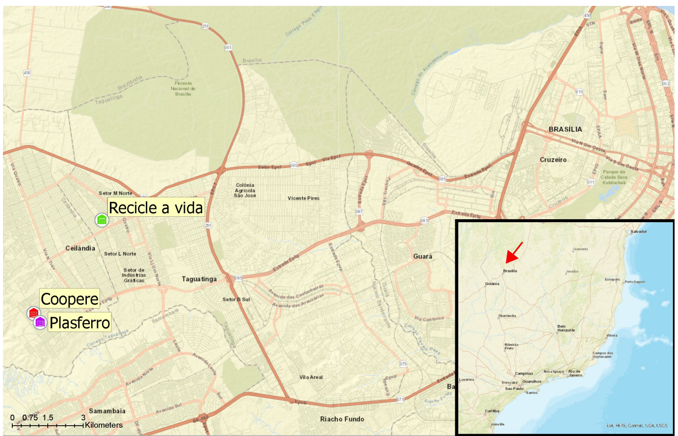
Figure 1. Localization map of the three WPOs in the Federal District (DF).

This analytical, cross-sectional case study involves three waste picker organizations located in the most populous area of the Federal District (Figure 1). The first WPO is called Recicle a Vida (A) and is located in the administrative region of Samambaia (193,485 inhabitants), in the Federal District (DF). The other two WPOs are waste recovery facilities operated by the city administration (SLU); they are called Plasferro (B) and Coopere (C). Both are located in the most populated administrative region, which is called Ceilândia (398,374 inhabitants). The following figure provides a view inside the three different workspaces Recicle a Vida (Figure 2A), Plasferro (Figure 2B) and Coopere (Figure 2C).